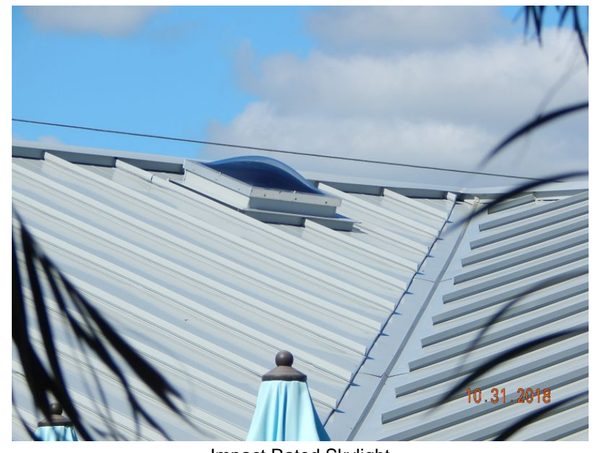
Impact Rated Skylight