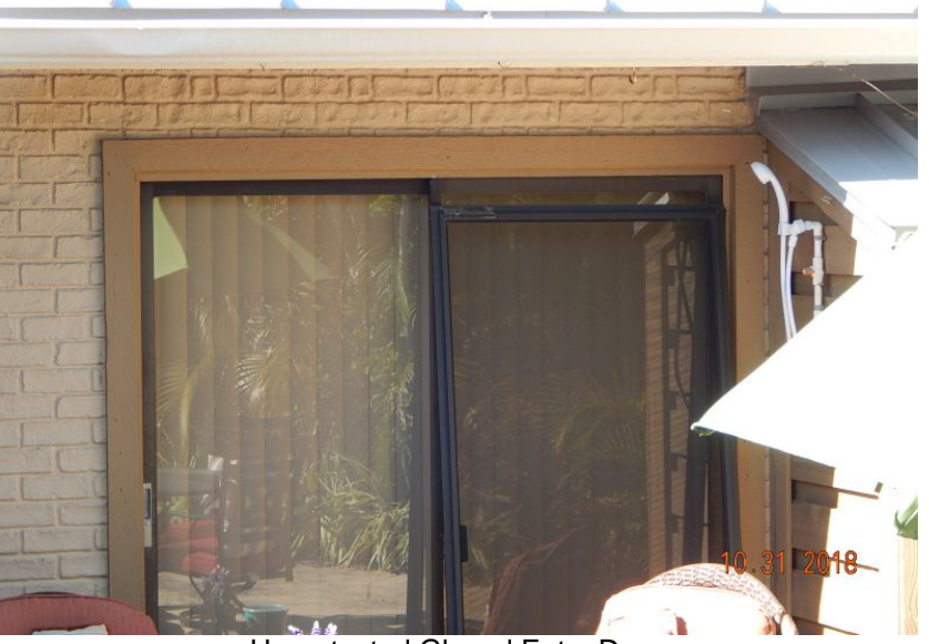
Unprotected Glazed Entry Door