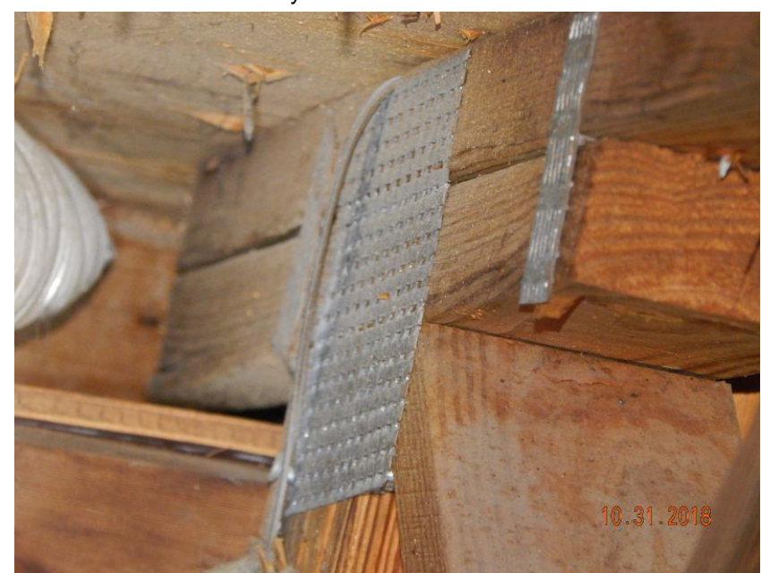
Metal Connector with 1 Nail on the Front Side & 0 Nails on the Opposing Side