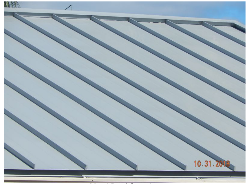
Metal Roof Covering