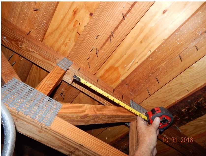
Plywood Over Battens