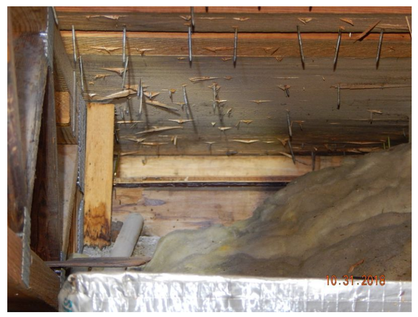
Metal Connector with 1 Nail on the Front Side & 0 Nails on the Opposing Side