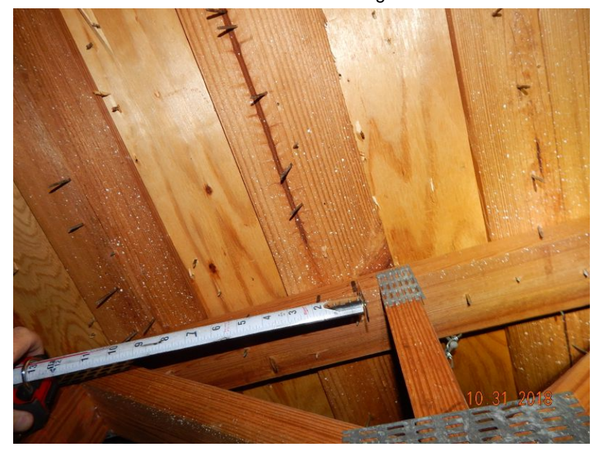
Plywood Over Battens