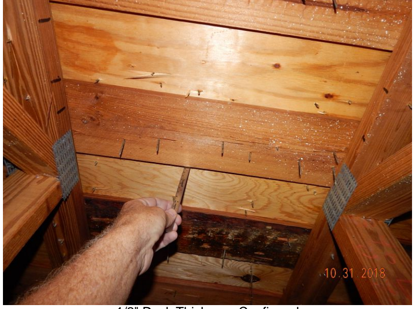
1/2" Deck Thickness Confirmed