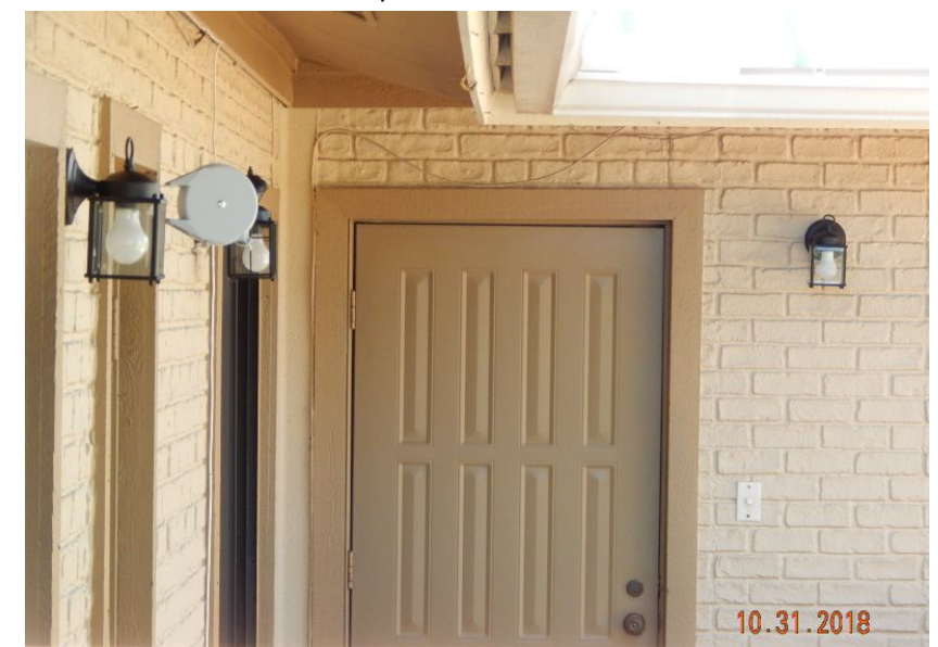
Unprotected Solid Entry Door