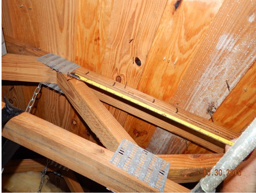
Plywood Over Battens