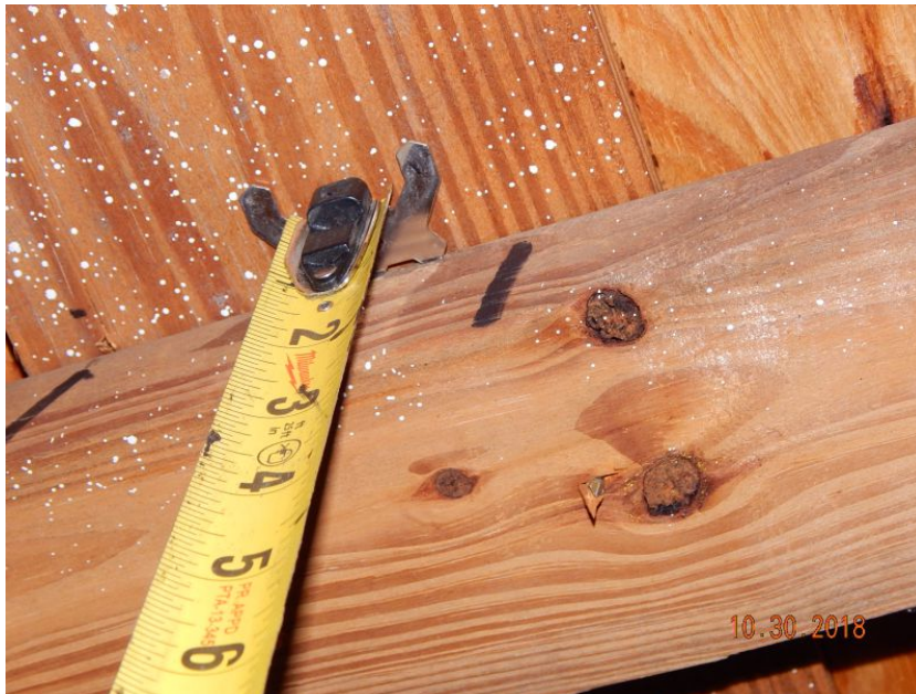
8d Nails; Measured with i520 Zircon Due to No Shiner