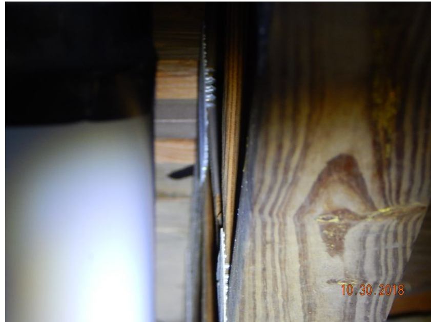
Metal Connector with Gap Greater than 1/2" from Truss