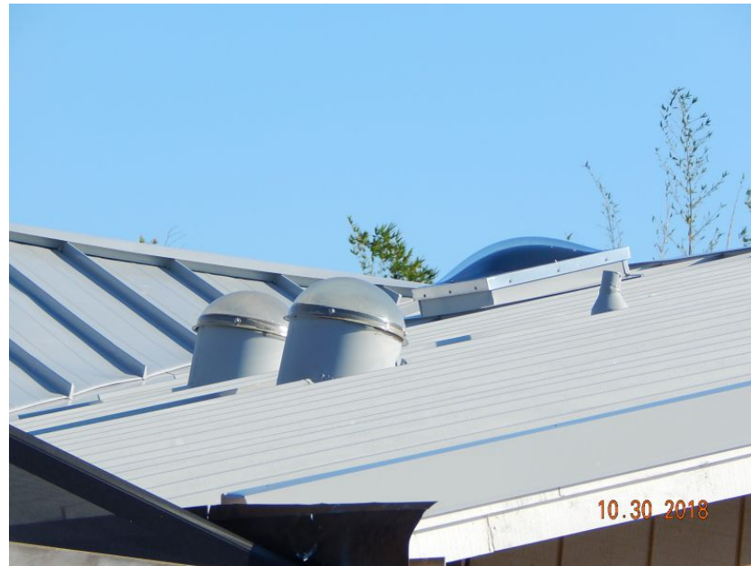
Impact Rated Skylight