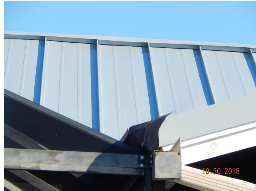
Metal Roof Covering