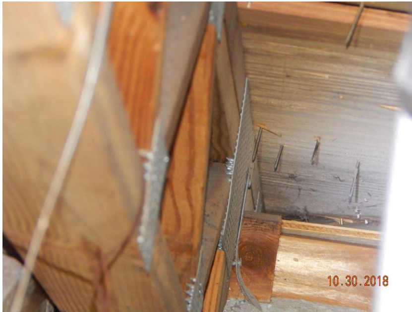
Metal Connector with Gap Greater than 1/2" from Truss