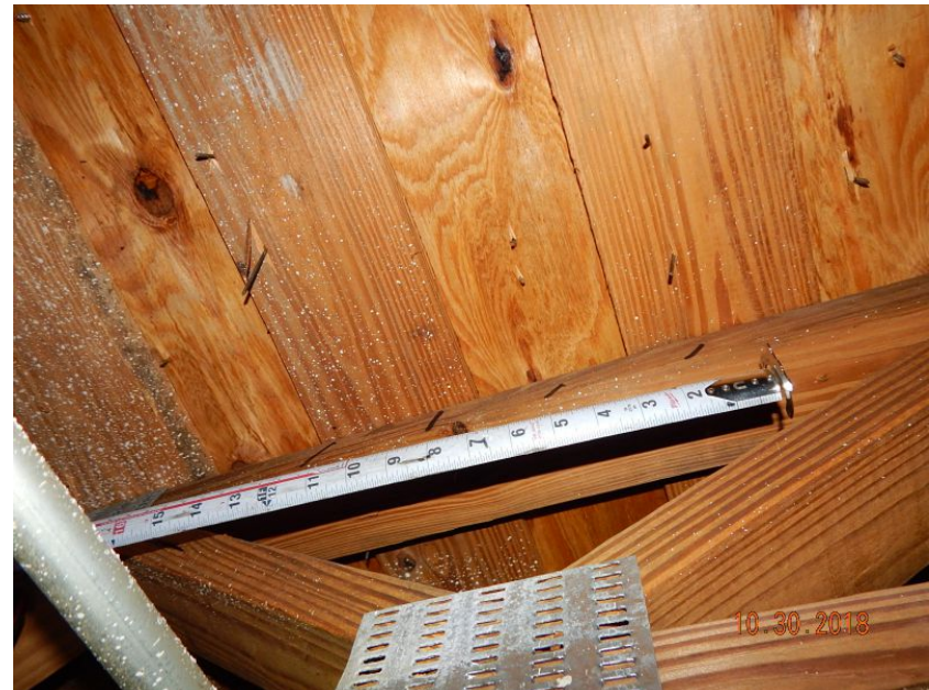
Plywood Over Battens