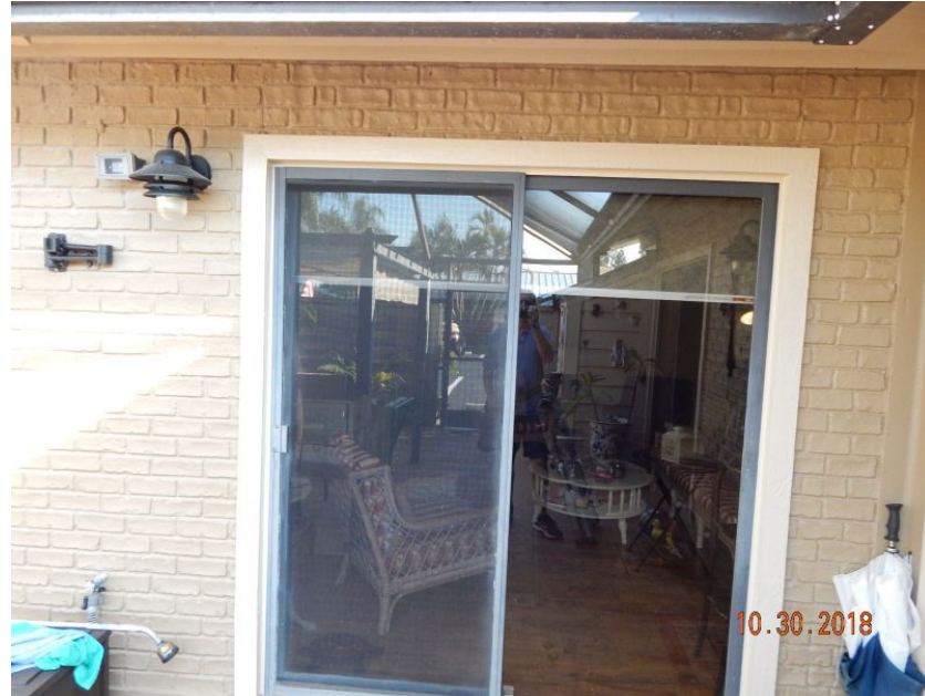
Unprotected Glazed Entry Door