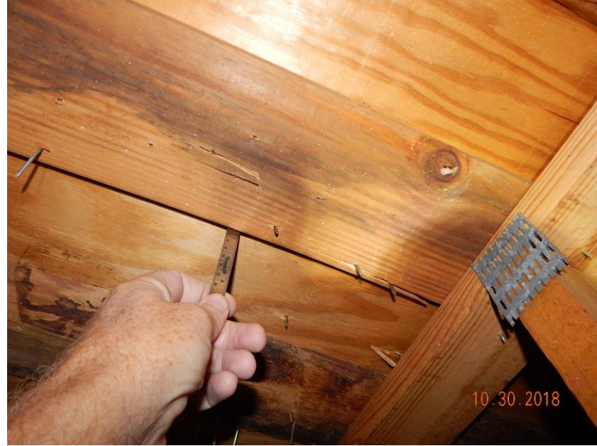
1/2" Deck Thickness Confirmed