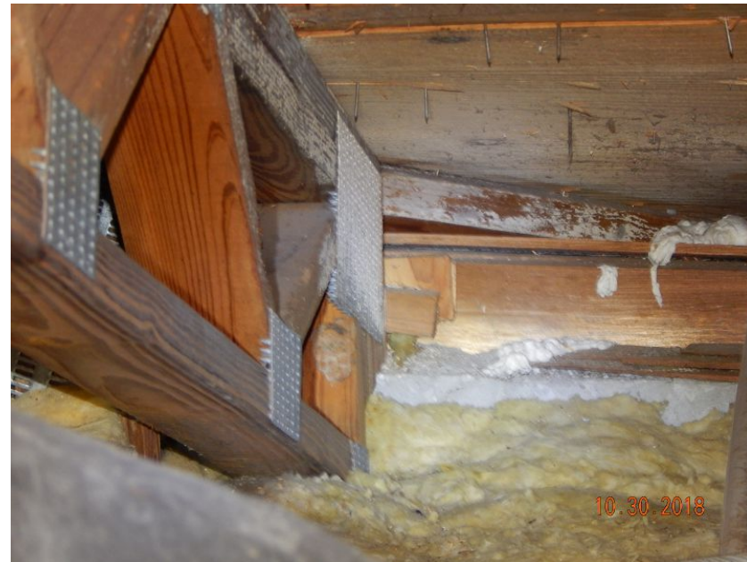
Metal Connector with 3 Nails on the Front Side & 0 Nails on the Opposing Side

This inspection was conducted solely to assist the policyholder to obtain windstorm mitigation insurance credits, if applicable, and may not be used for any other purpose. Thank you for using DMI. For comments, questions, or to request an inspection please contact Don Meyler Inspections at (800) 469-0434 or at info@windstorminspections.com