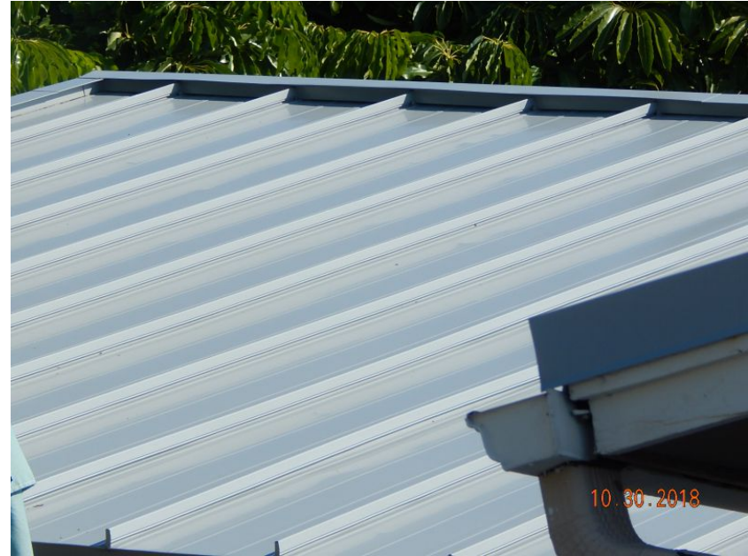
Metal Roof Covering