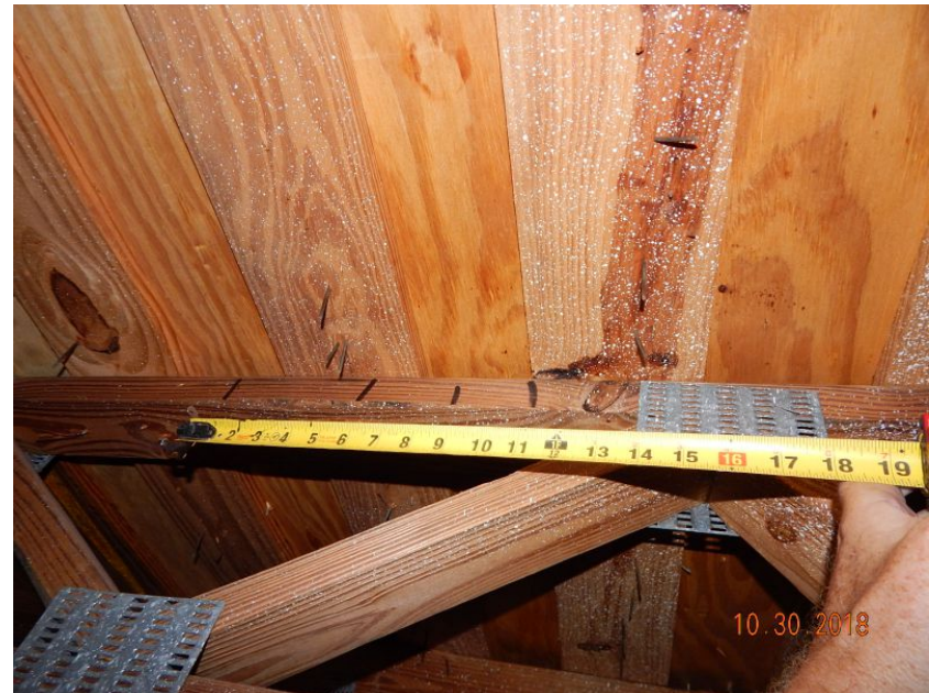
Plywood Over Battens