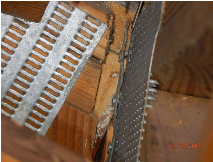
Metal Connector with 3 Nails on the Front Side & 0 Nails on the Opposing Side