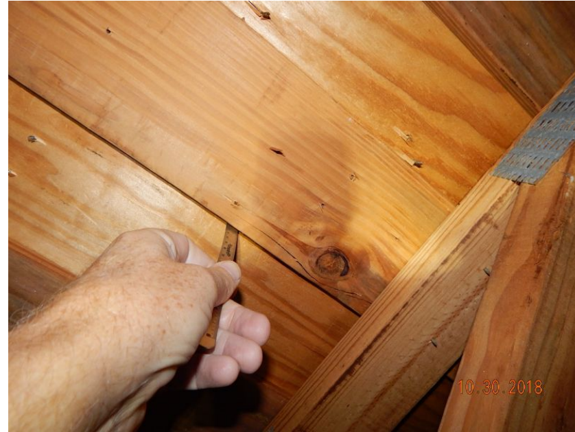
1/2" Deck Thickness Confirmed