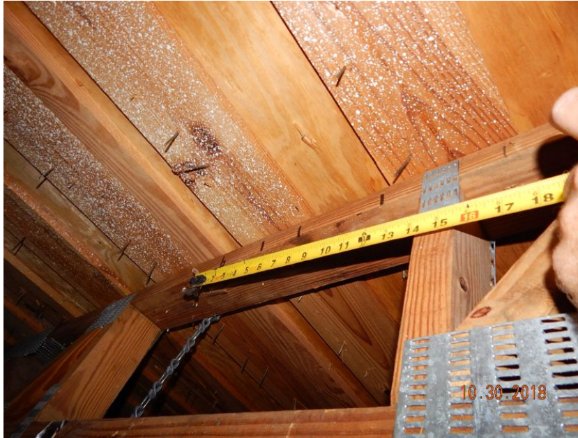
Plywood Over Battens