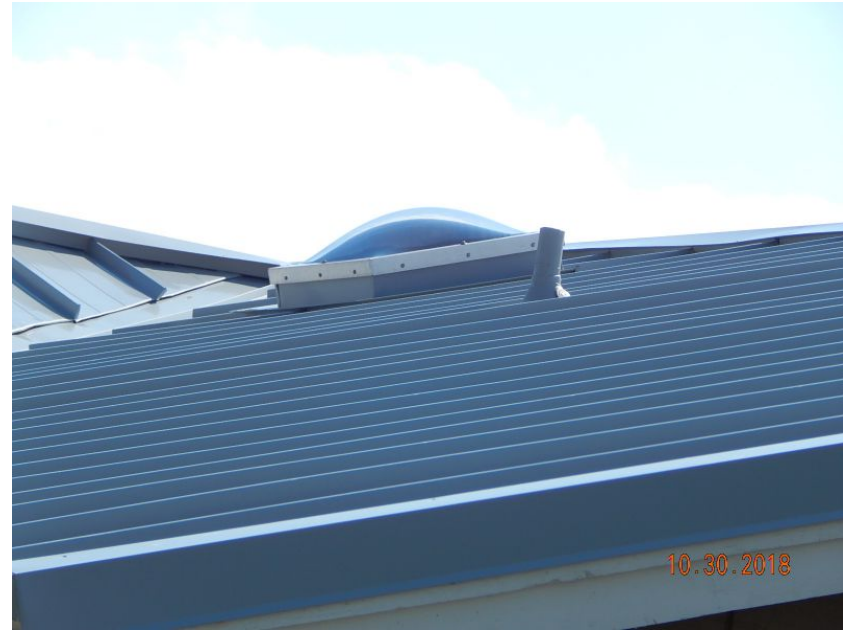
Impact Rated Skylight