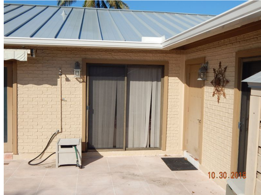
Unprotected Glazed Entry Door