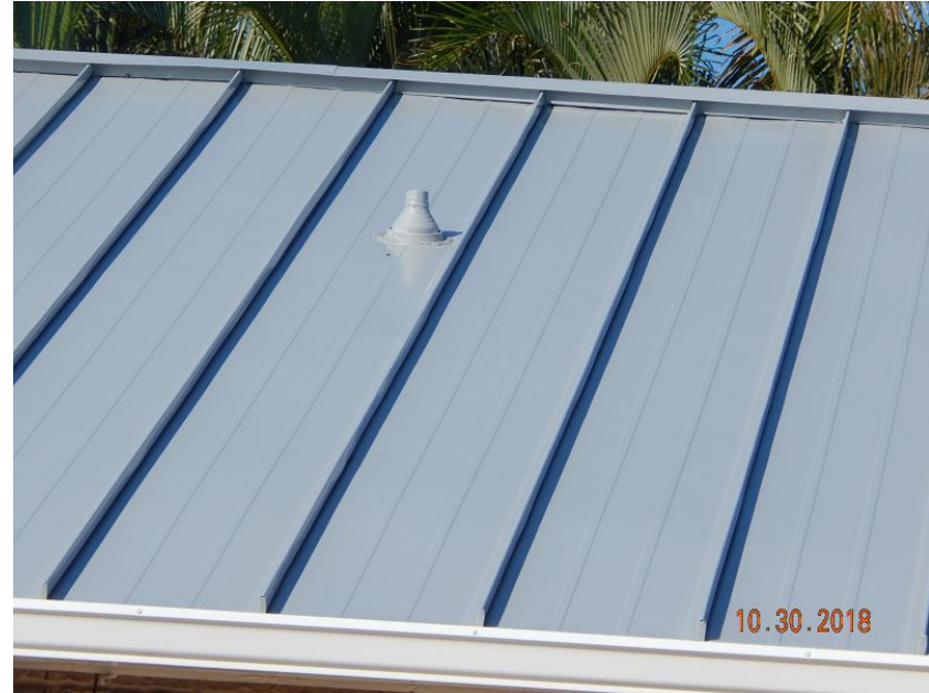
Metal Roof Covering