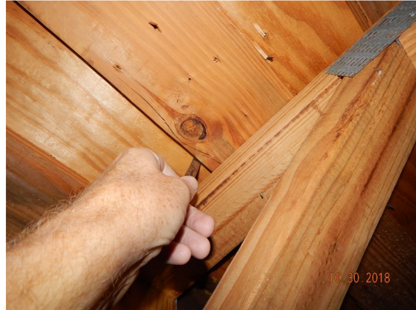
1/2" Deck Thickness Confirmed