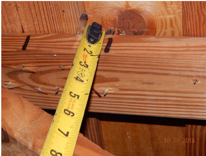
8d Nails; Measured with i520 Zircon Due to No Shiner