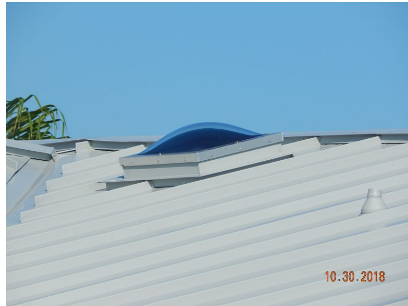
Impact Rated Skylight