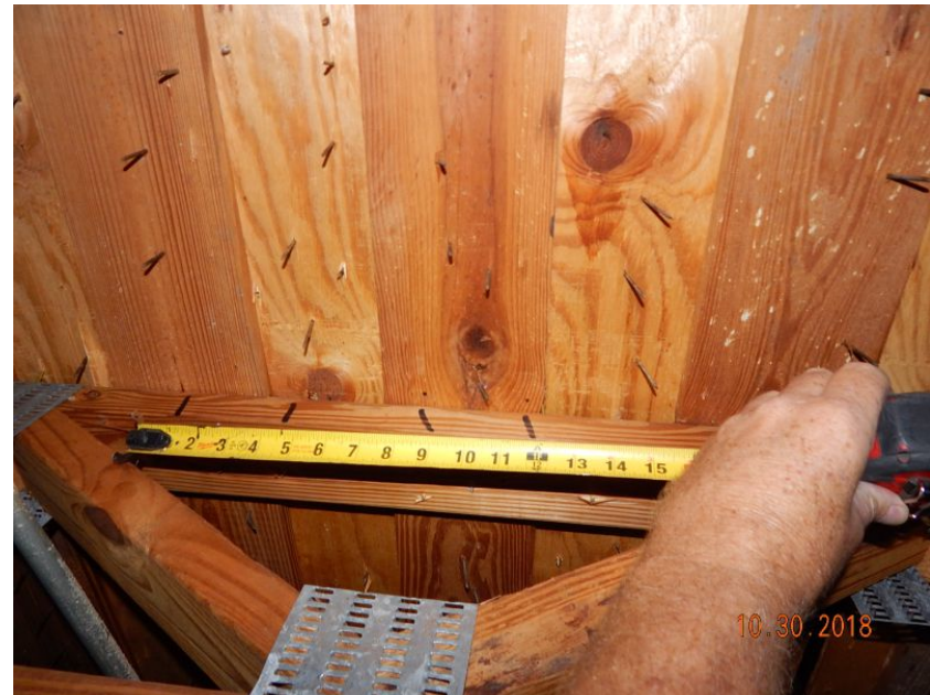
Plywood Over Battens