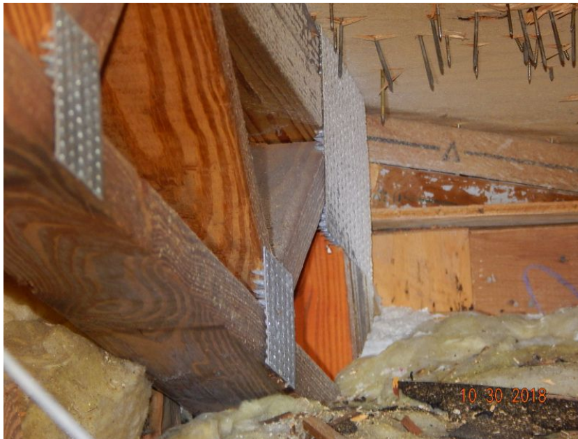
Metal Connector with 2 Nails on the Front Side & 0 Nails on the Opposing Side