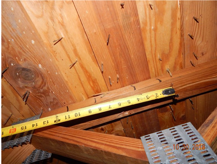
Plywood Over Battens