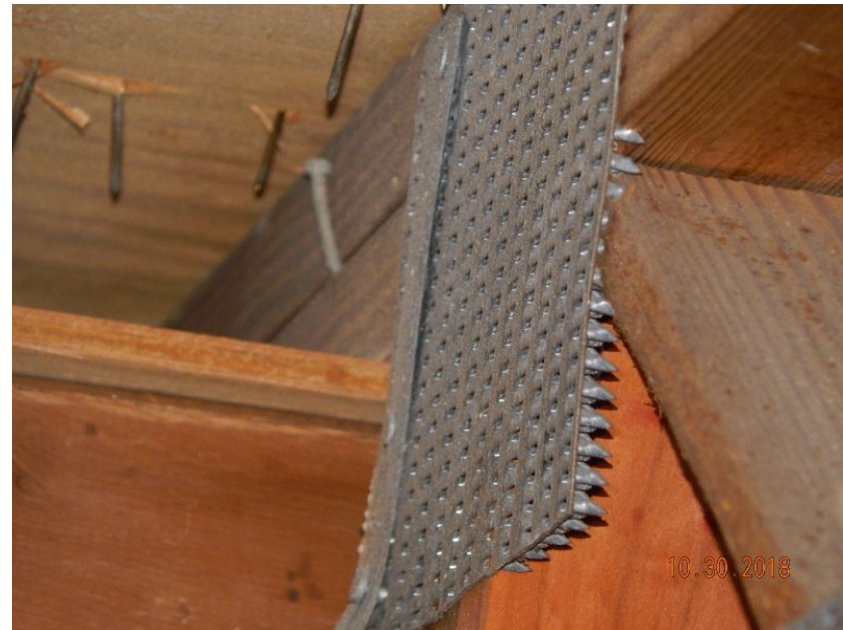
Metal Connector with 2 Nails on the Front Side & 0 Nails on the Opposing Side

This inspection was conducted solely to assist the policyholder to obtain windstorm mitigation insurance credits, if applicable, and may not be used for any other purpose. Thank you for using DMI. For comments, questions, or to request an inspection please contact Don Meyler Inspections at (800) 469-0434 or at info@windstorminspections.com