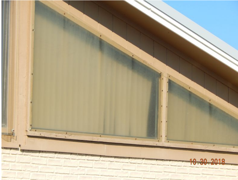
Non-Impact Rated Panel Shutters