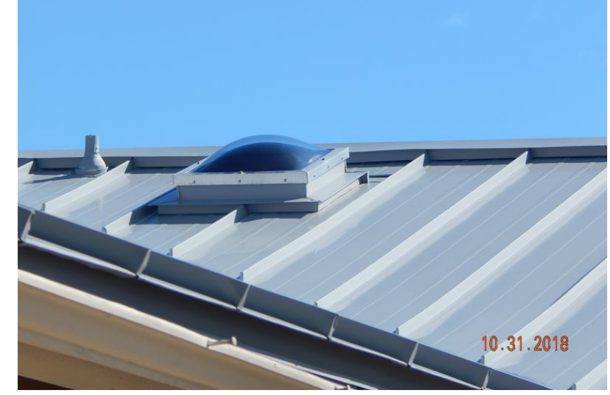
Impact Rated Skylight