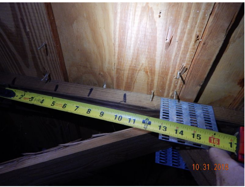
Plywood Over Battens