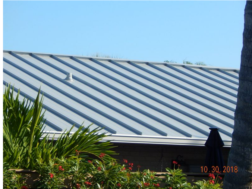
Metal Roof Covering