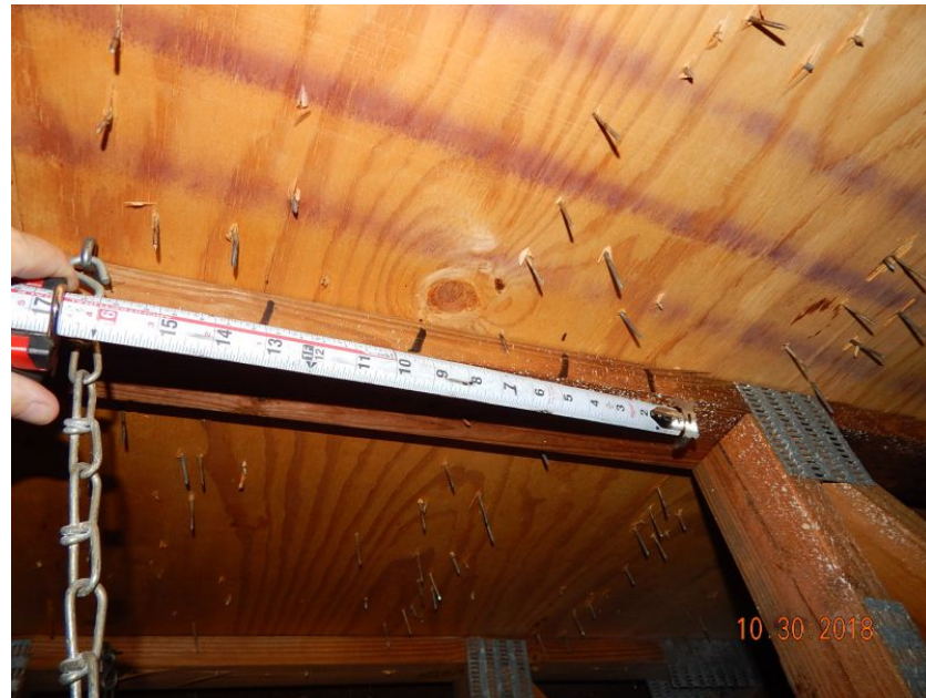
Plywood Over Battens