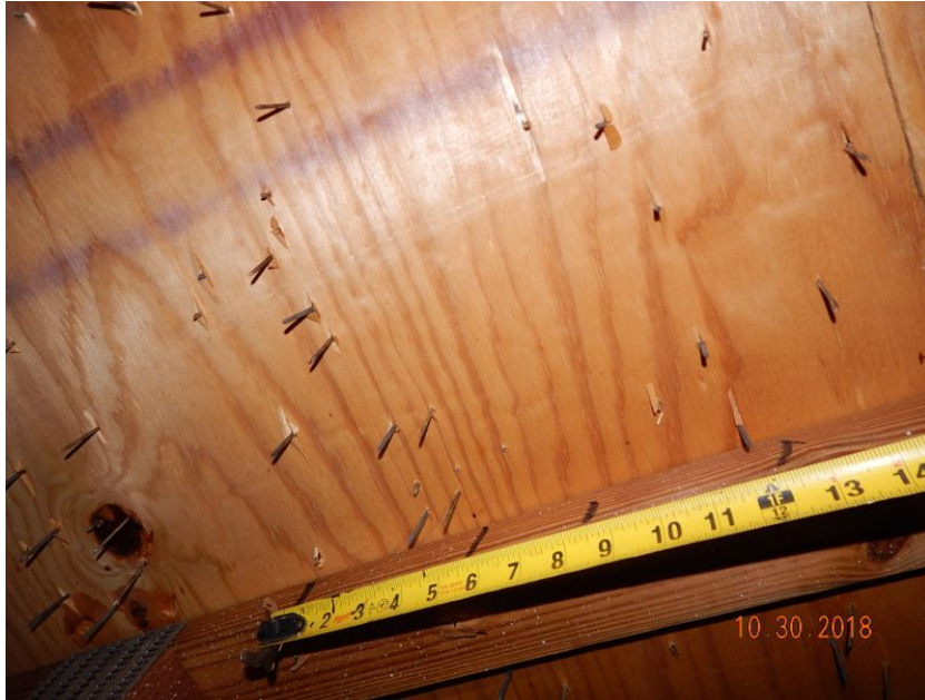
Plywood Over Battens