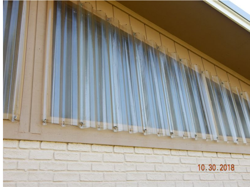
Non-Impact Rated Panel Shutters