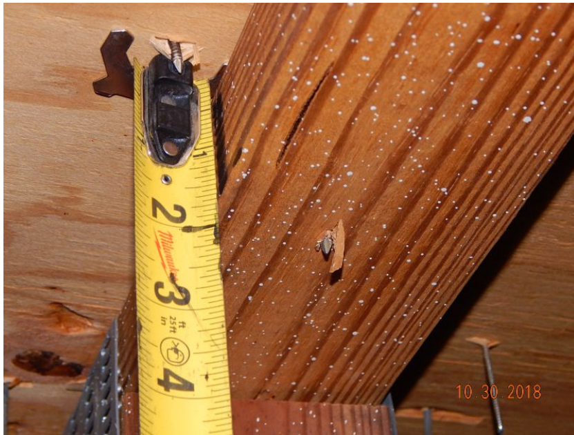
8d Nails or Greater in Size