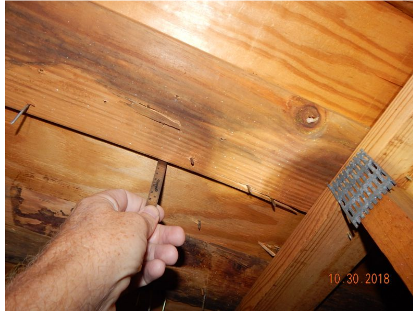
1/2" Deck Thickness Confirmed