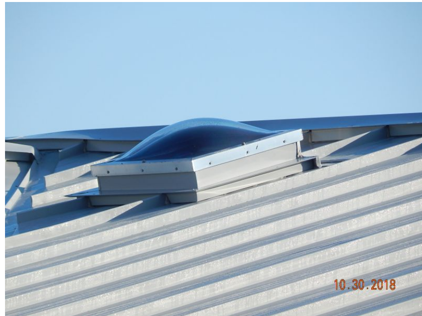
Impact Rated Skylight