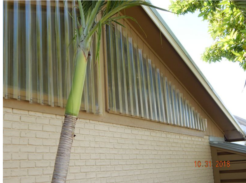
Non-Impact Rated Panel Shutters