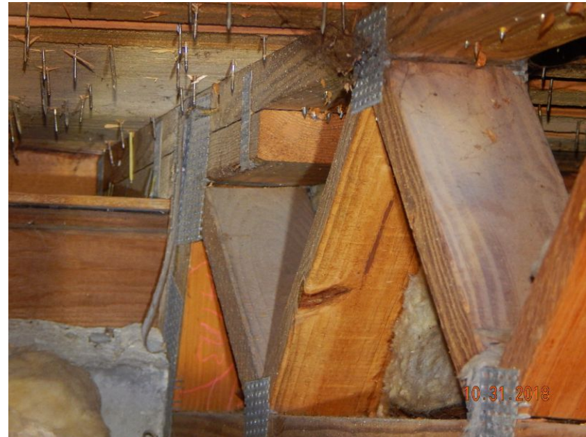
Metal Connector with Gap Greater than 1/2" from Truss