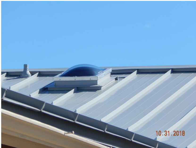
Impact Rated Skylight