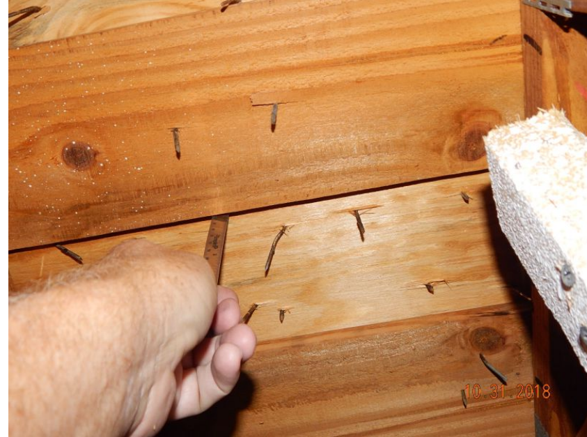
1/2" Deck Thickness Confirmed