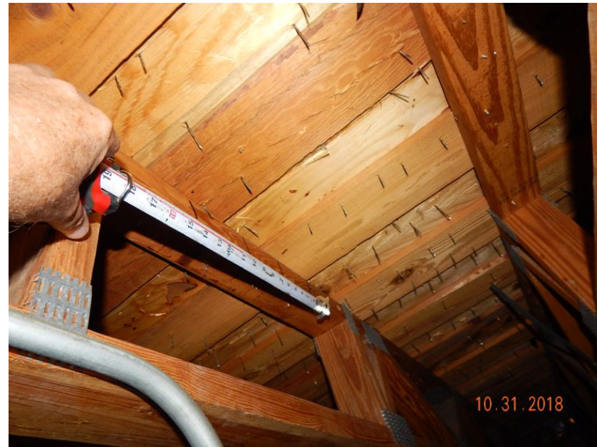
Plywood Over Battens