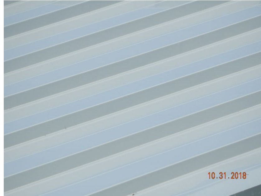
Metal Roof Covering