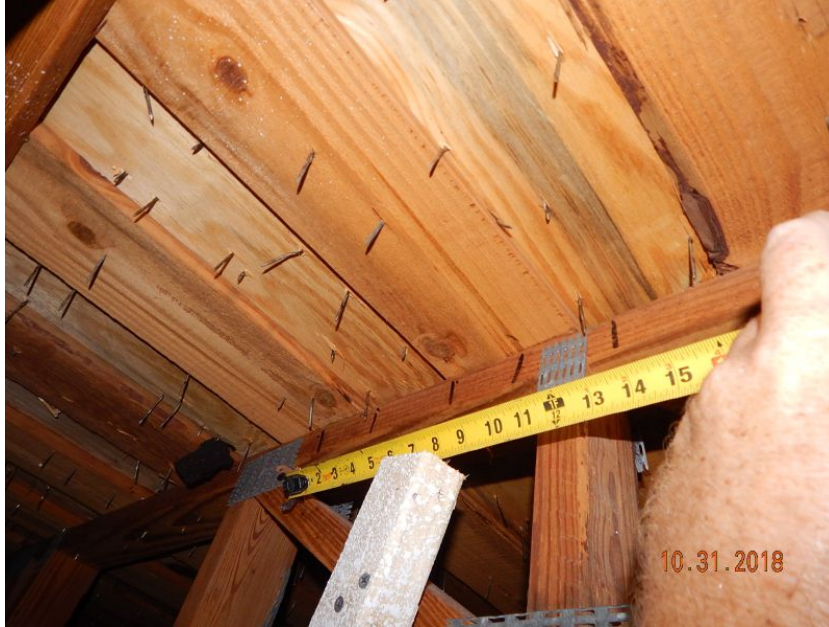
Plywood Over Battens