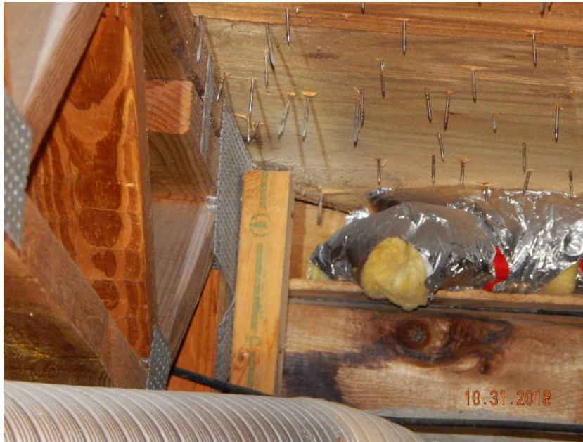
Metal Connector with Gap Greater than 1/2" from Truss