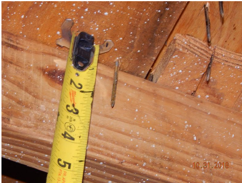
8d Nails or Greater in Size