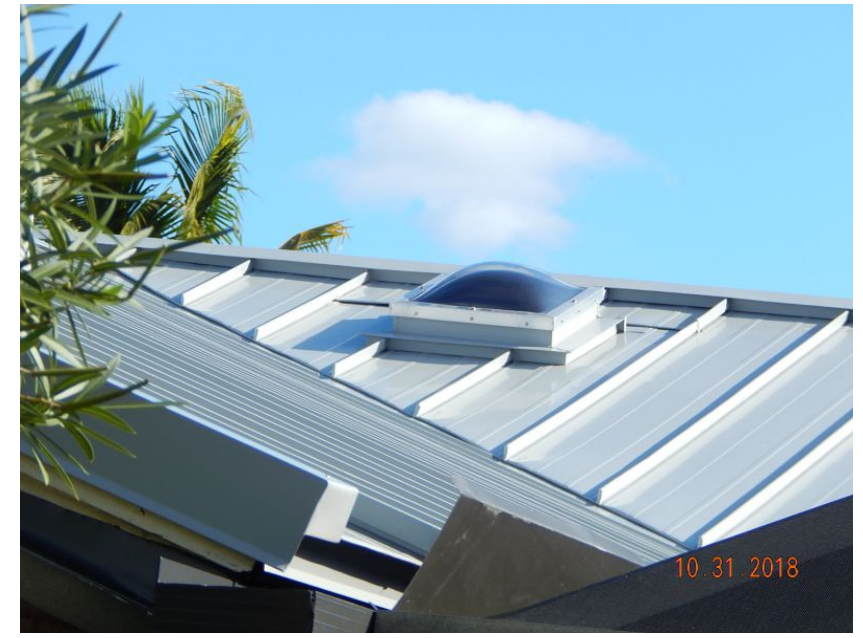
Impact Rated Skylight