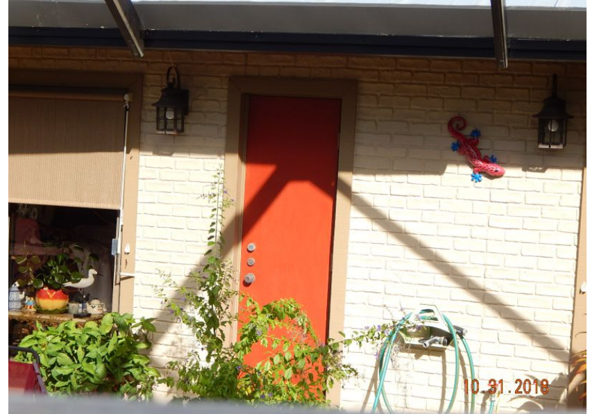
Unprotected Solid Entry Door