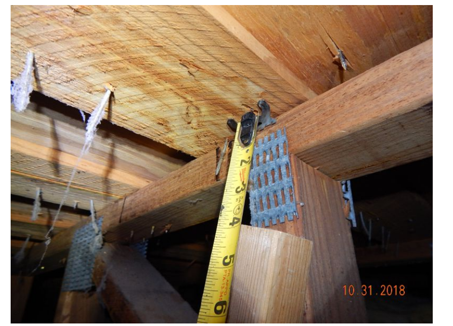
8d Nails or Greater in Size