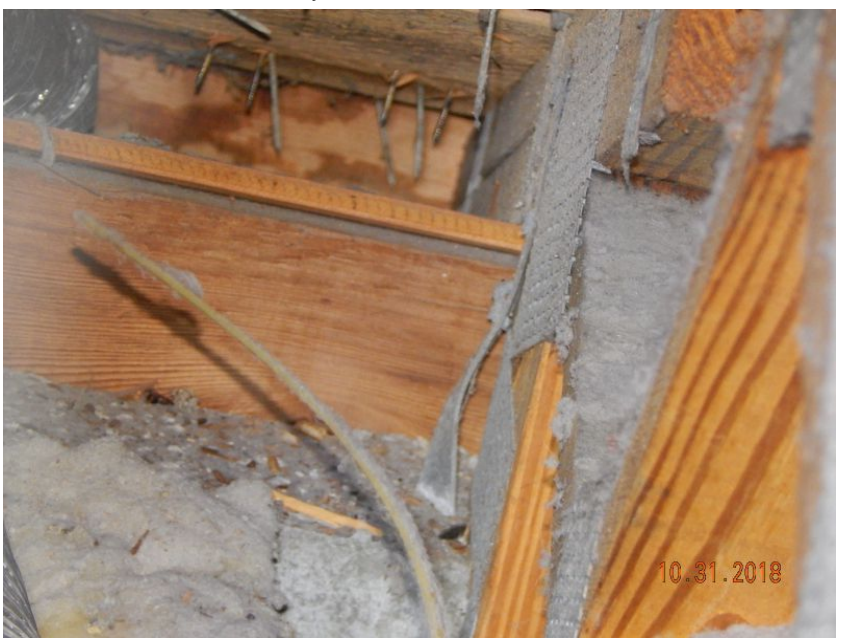
Metal Connector with Gap Greater than 1/2" from Truss