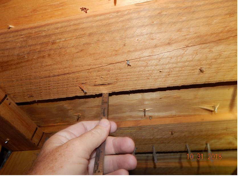
1/2" Deck Thickness Confirmed