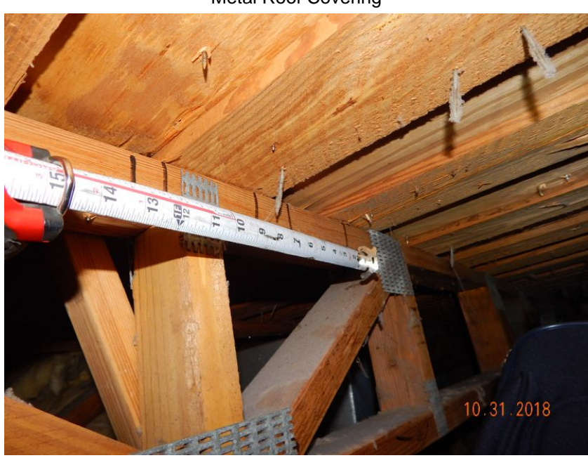
Plywood Over Battens