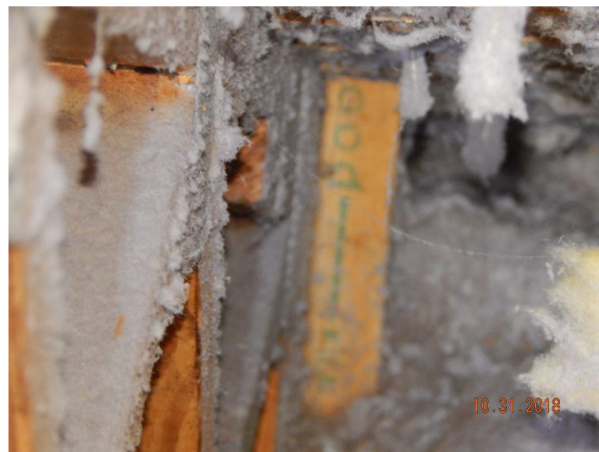
Metal Connector with Gap Greater than 1/2" from Truss