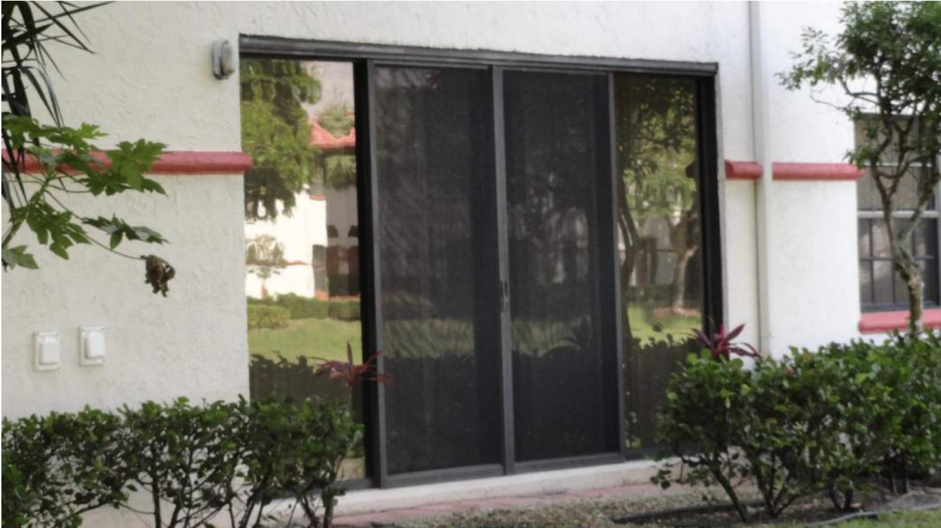
7. Opening Protection - Unprotected Unrated Glazed Entry Doors