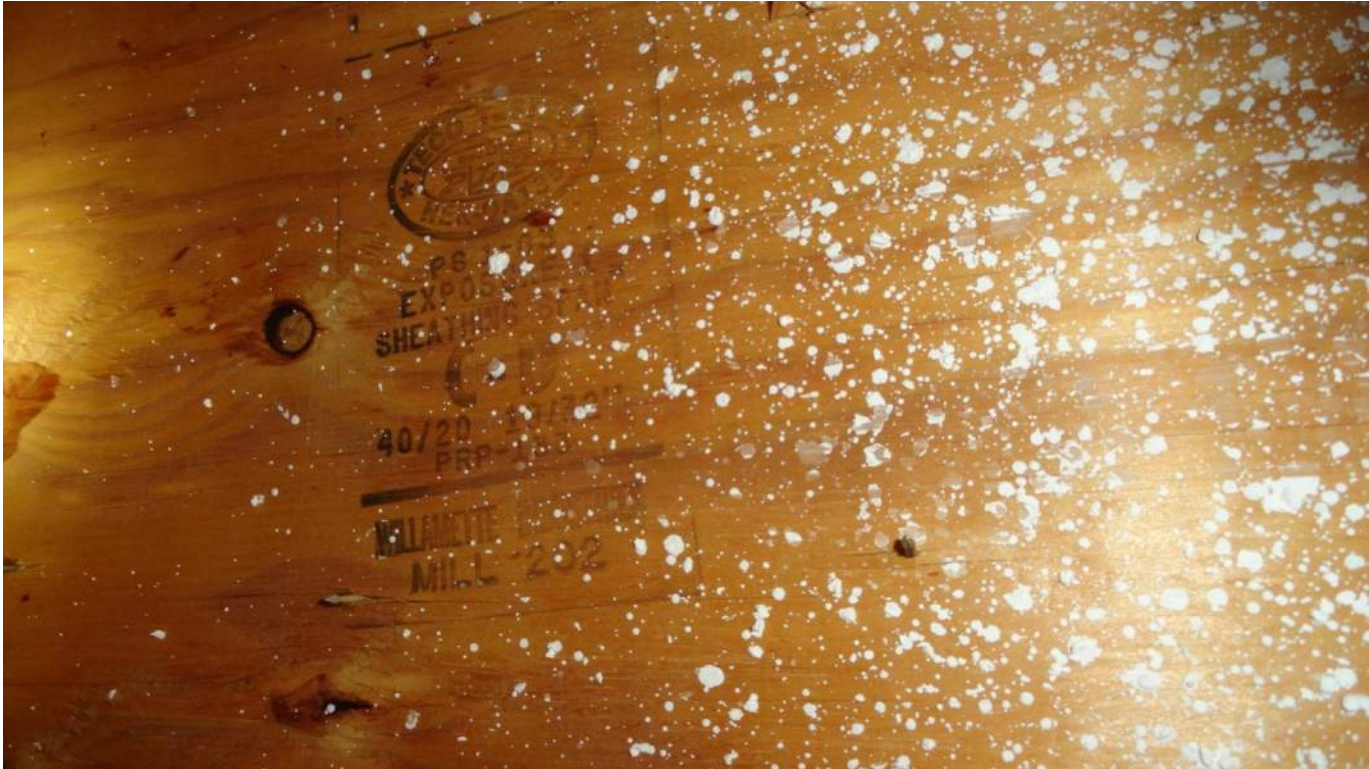
3. Roof Deck Attachment - 19/32" Plywood Deck