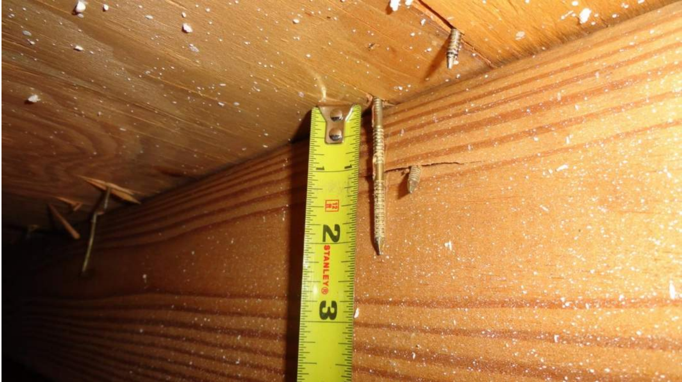
3. Roof Deck Attachment - 8d Ring Shank Nails