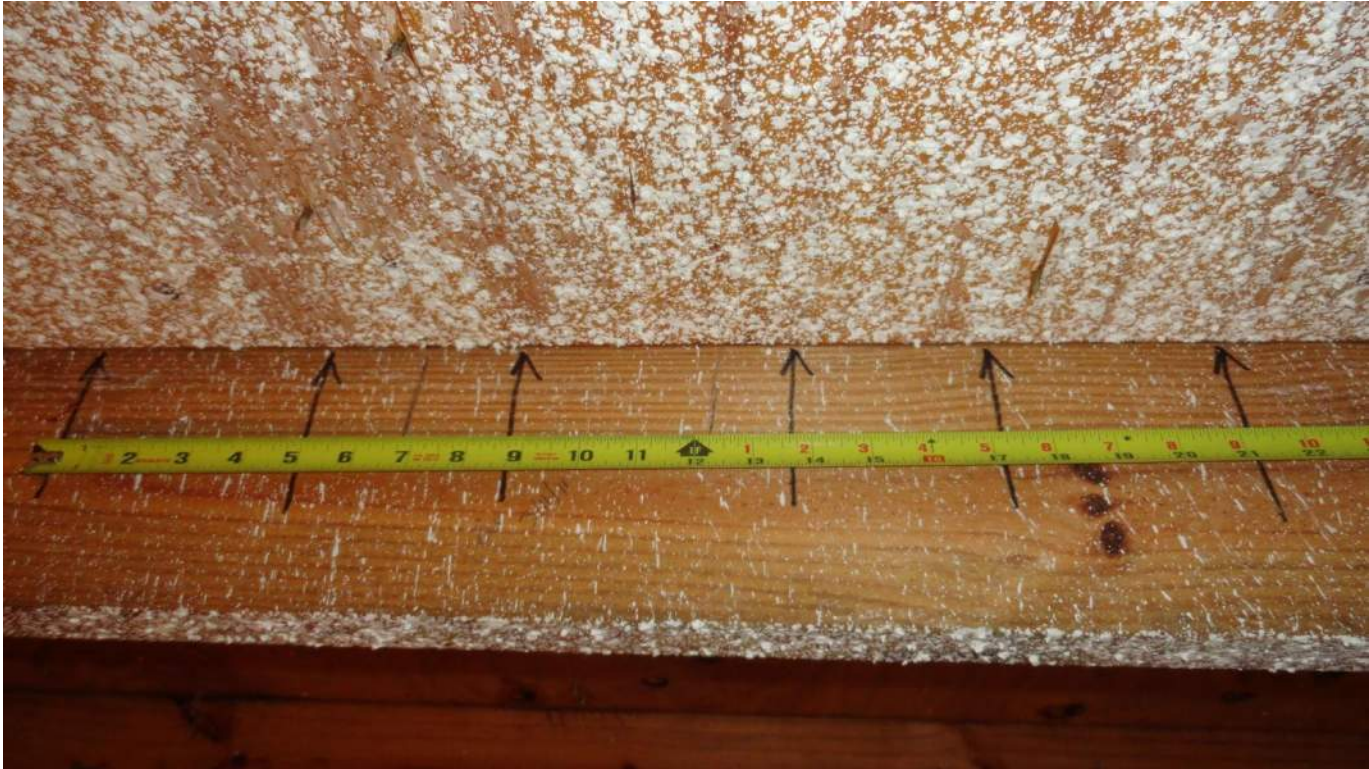
3. Roof Deck Attachment - Nails at 6" O. C. Max. in the Field