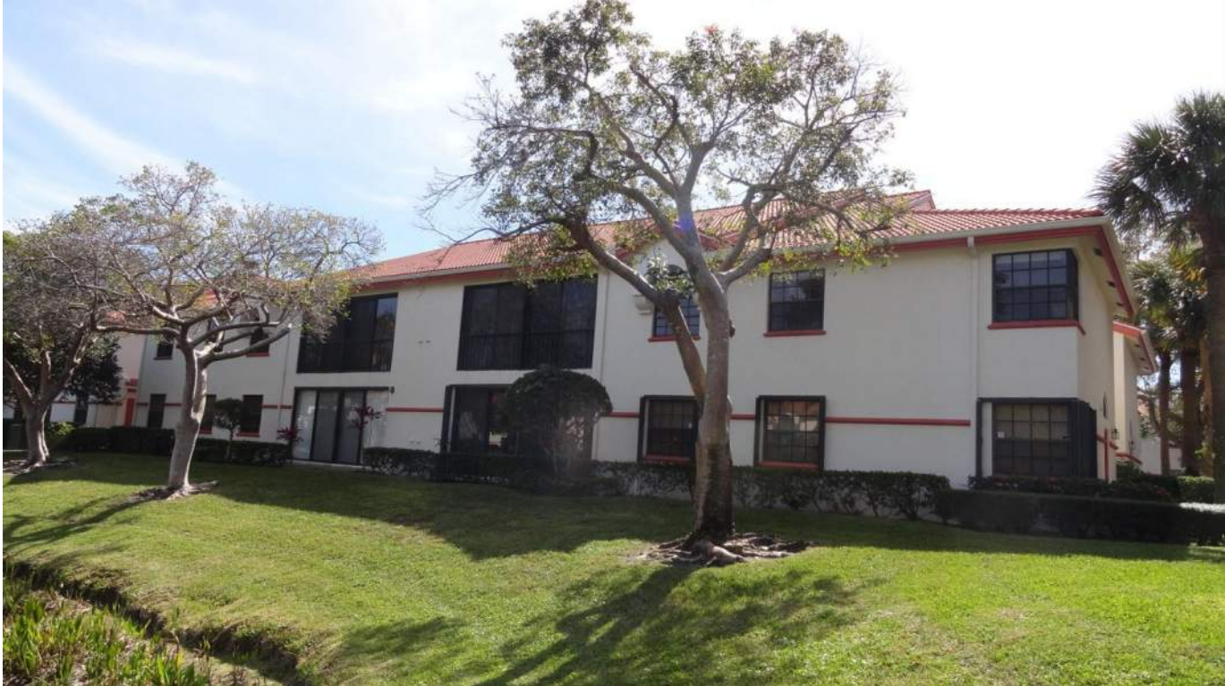
5. Roof Geometry - Rear Elevation - Hip