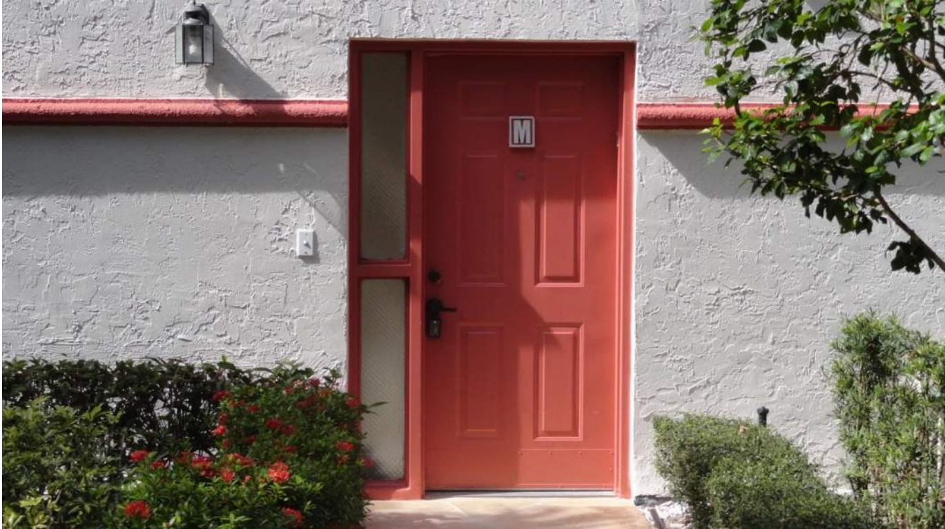
7. Opening Protection - Unprotected Unrated Unglazed Entry Doors