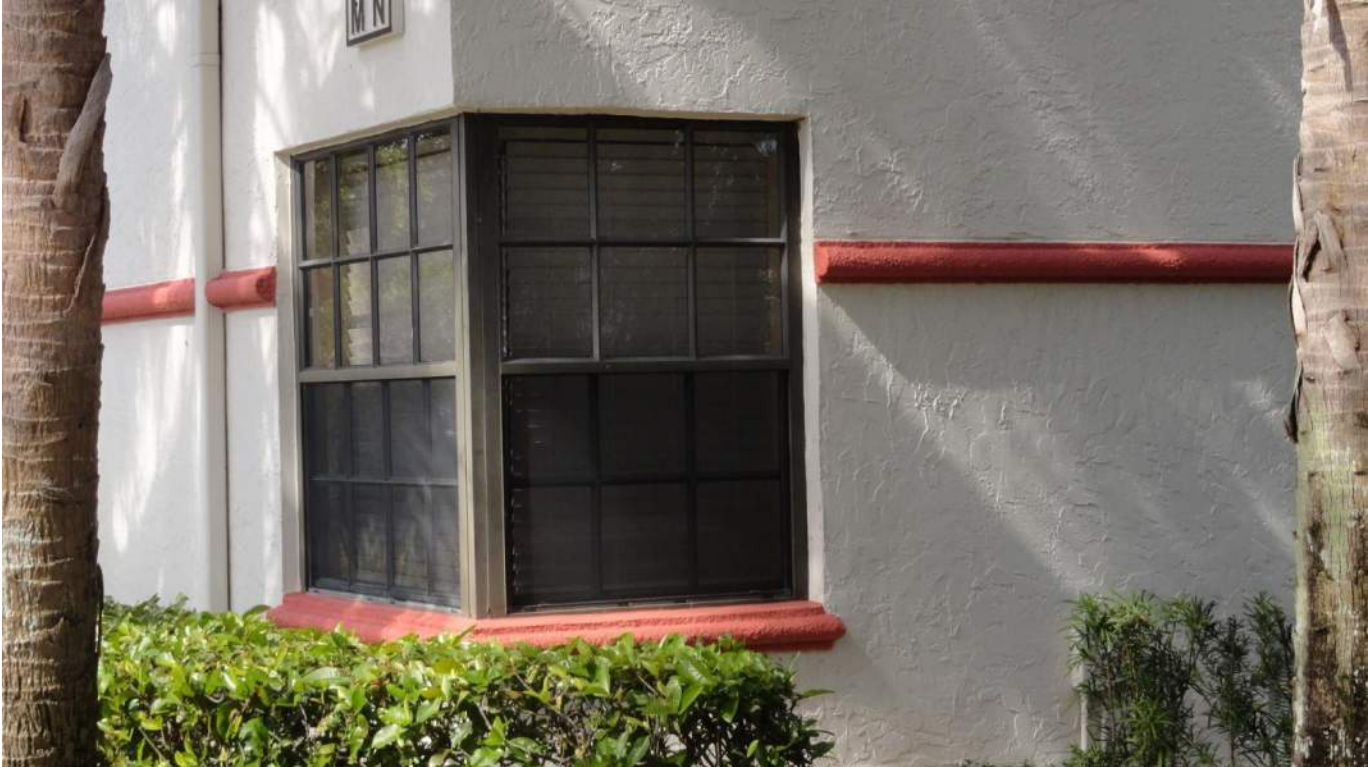
7. Opening Protection - Unprotected Unrated Windows