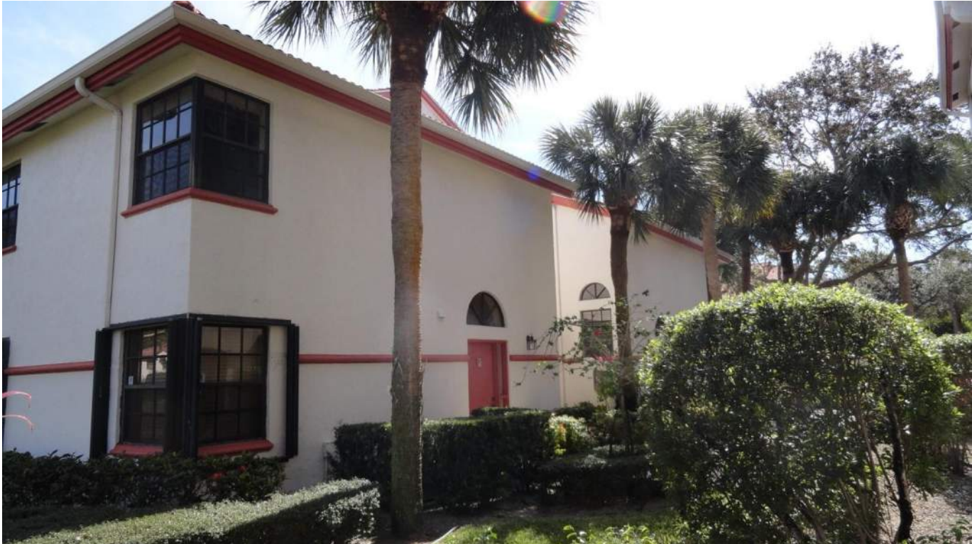
5. Roof Geometry - Left Elevation - Non-Hip