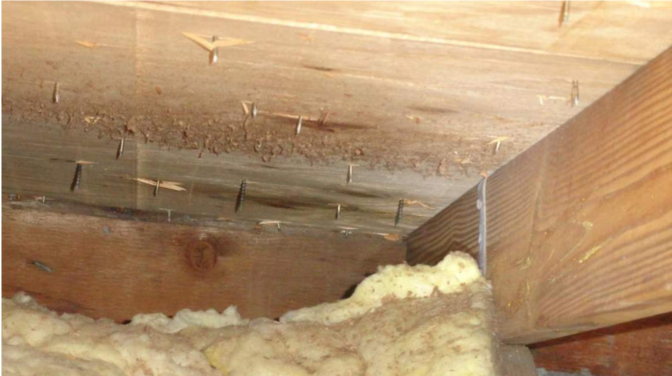
4. Roof to Wall Attachment - Single Wraps - Steel Straps w/ 1 Nail Min. at Back