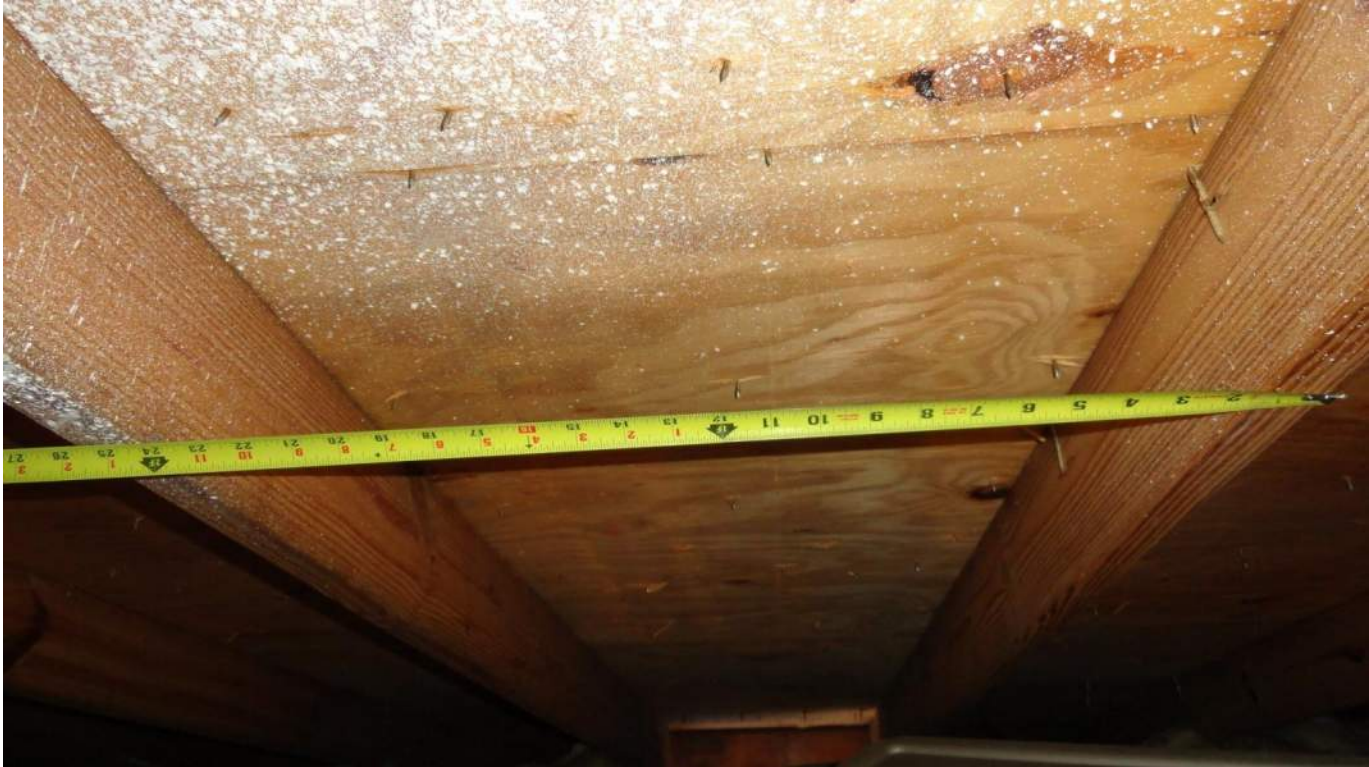
3. Roof Deck Attachment - Trusses at 24" O. C. Max.