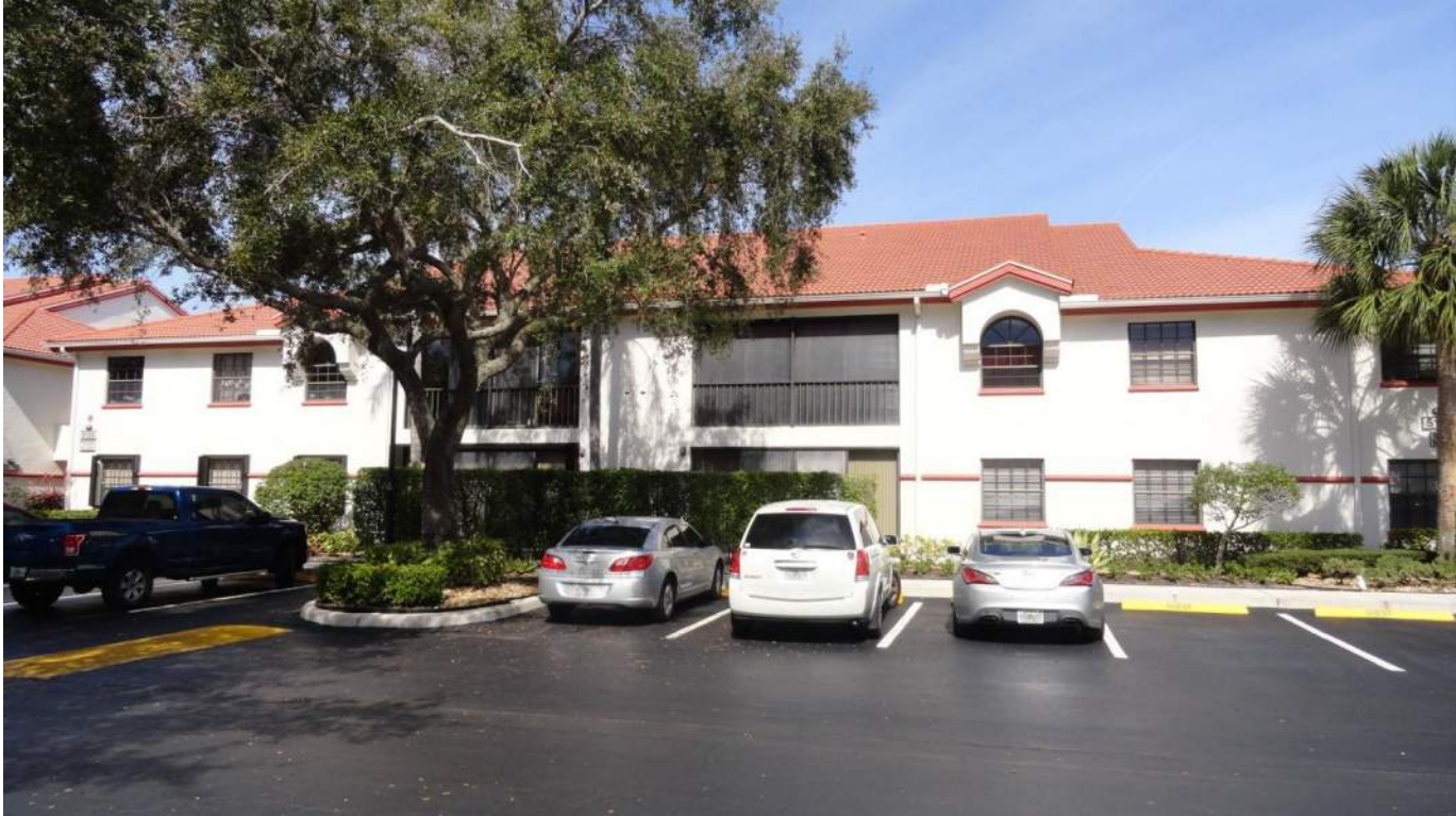
5. Roof Geometry - Front Elevation - Hip