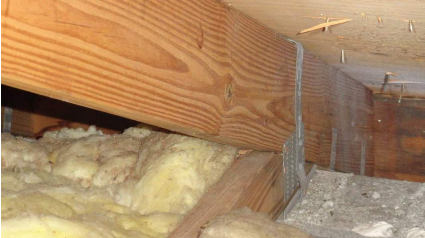
4. Roof to Wall Attachment - Single Wraps - Steel Straps w/ 2 Nails Min. at Face