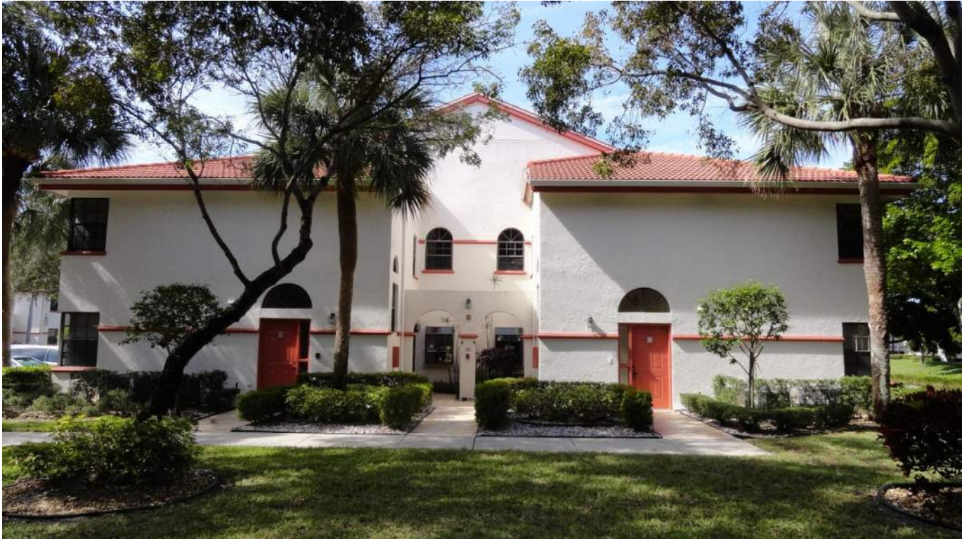
5. Roof Geometry - Right Elevation - Non-Hip