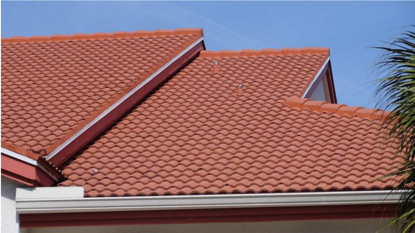
2. Roof Covering - Concrete Tile