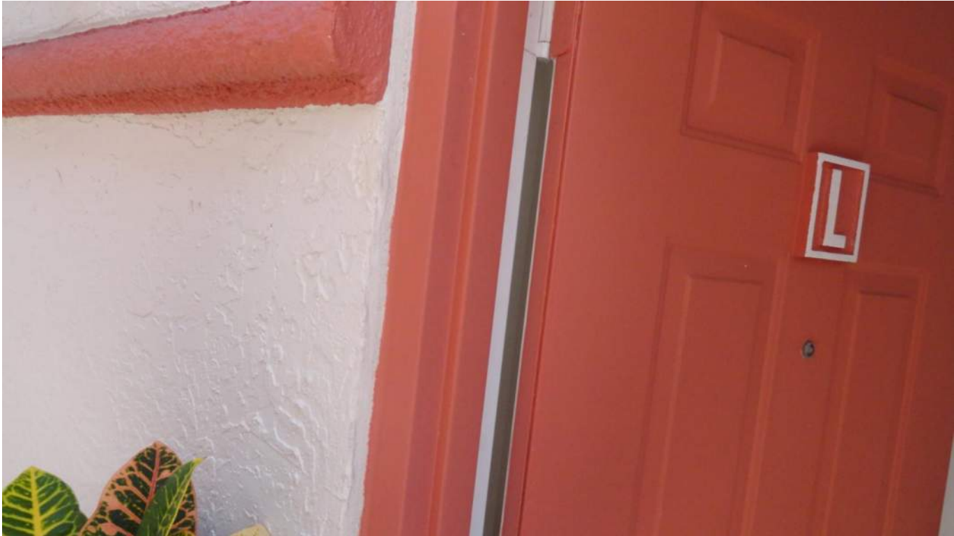
7. Opening Protection - Unprotected Unrated Unglazed Entry Doors