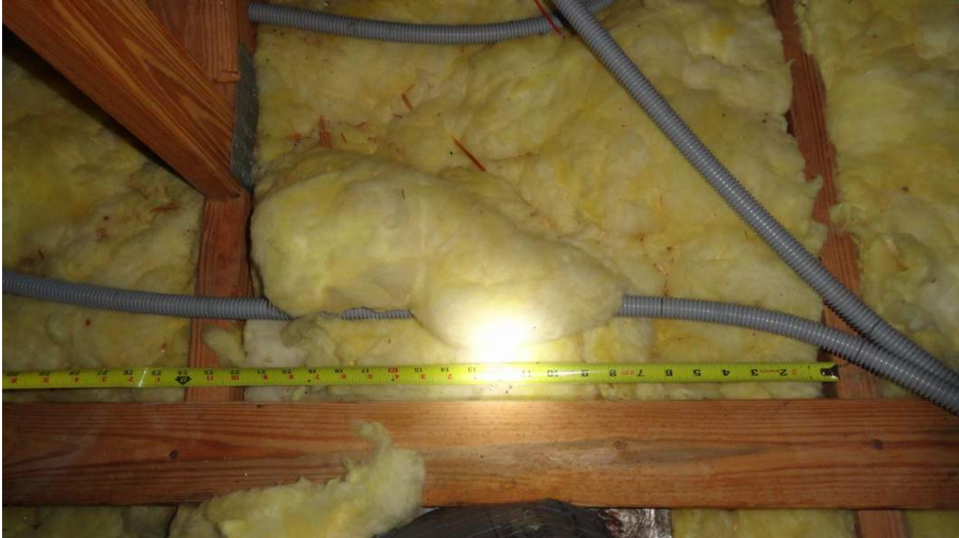
3. Roof Deck Attachment - Trusses at 24" O. C. Max.