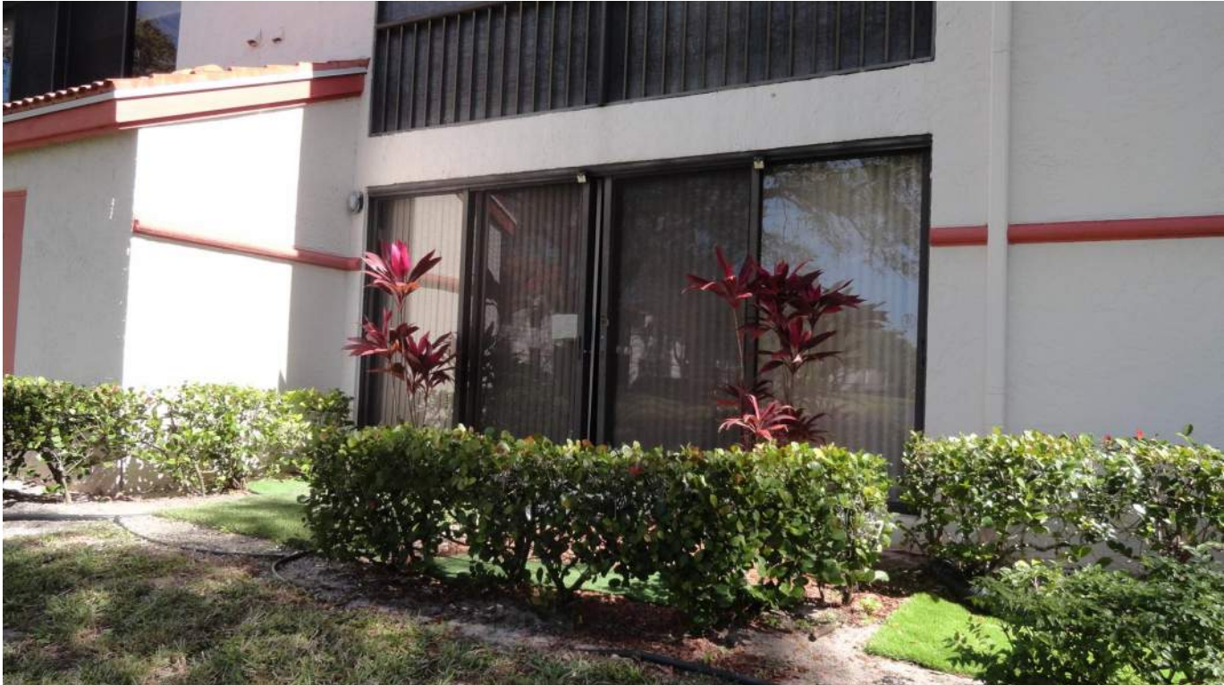
7. Opening Protection - Unprotected Unrated Glazed Entry Doors