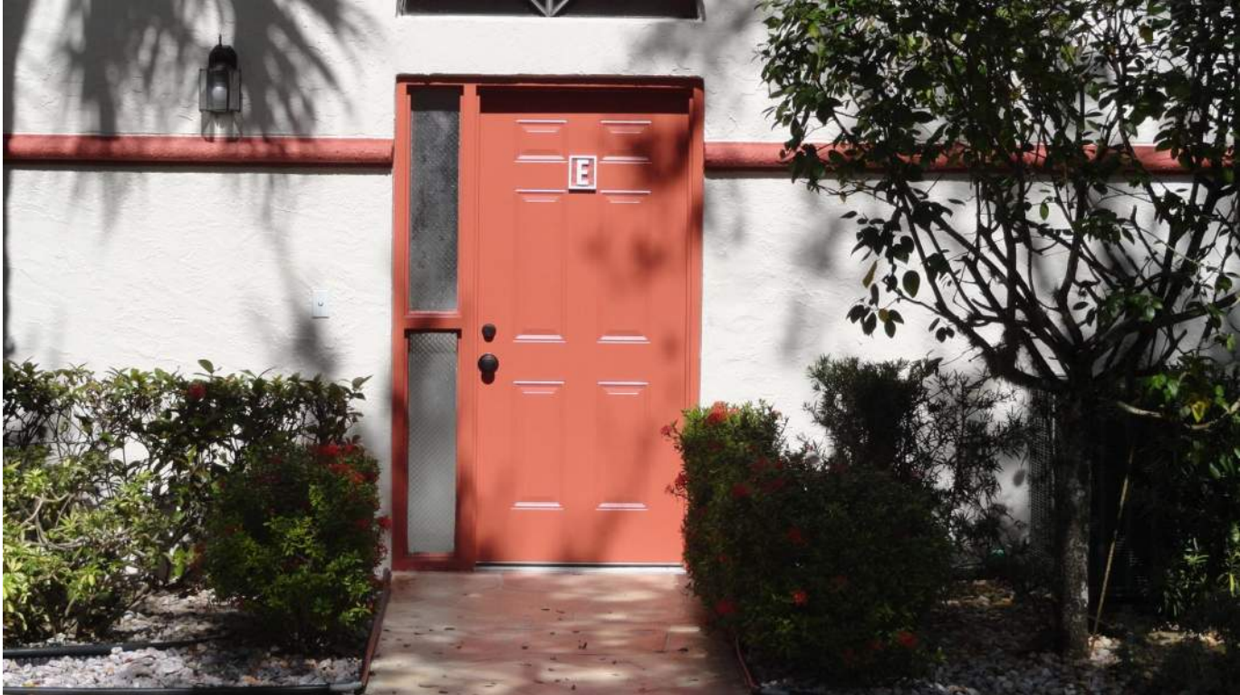
7. Opening Protection - Unprotected Unrated Unglazed Entry Doors