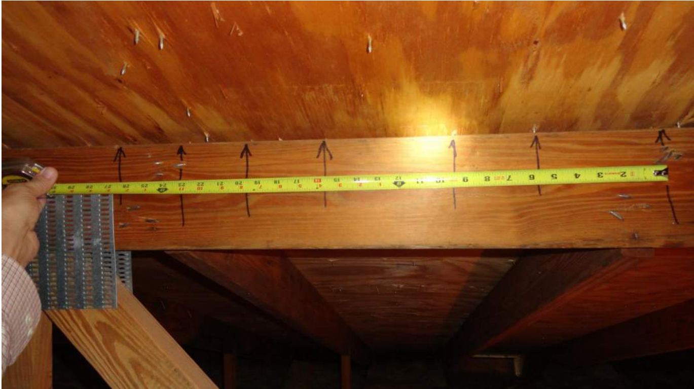
3. Roof Deck Attachment - Nails at 6" O. C. Max. in the Field