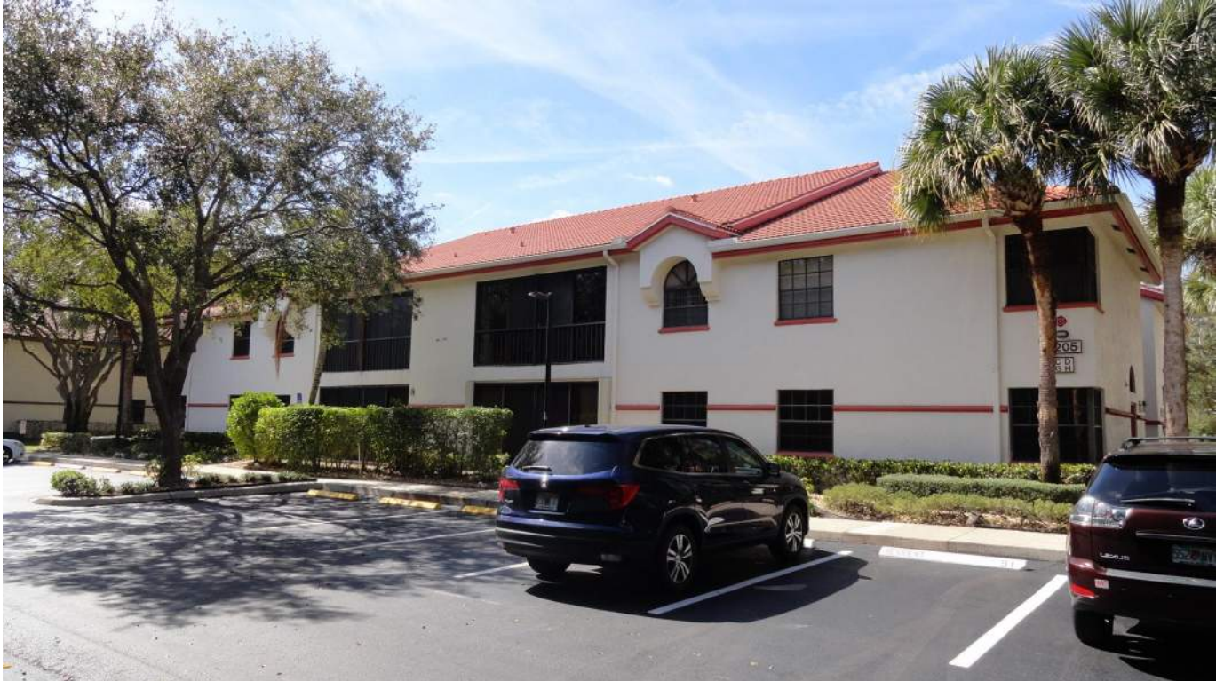
5. Roof Geometry - Front Elevation - Hip