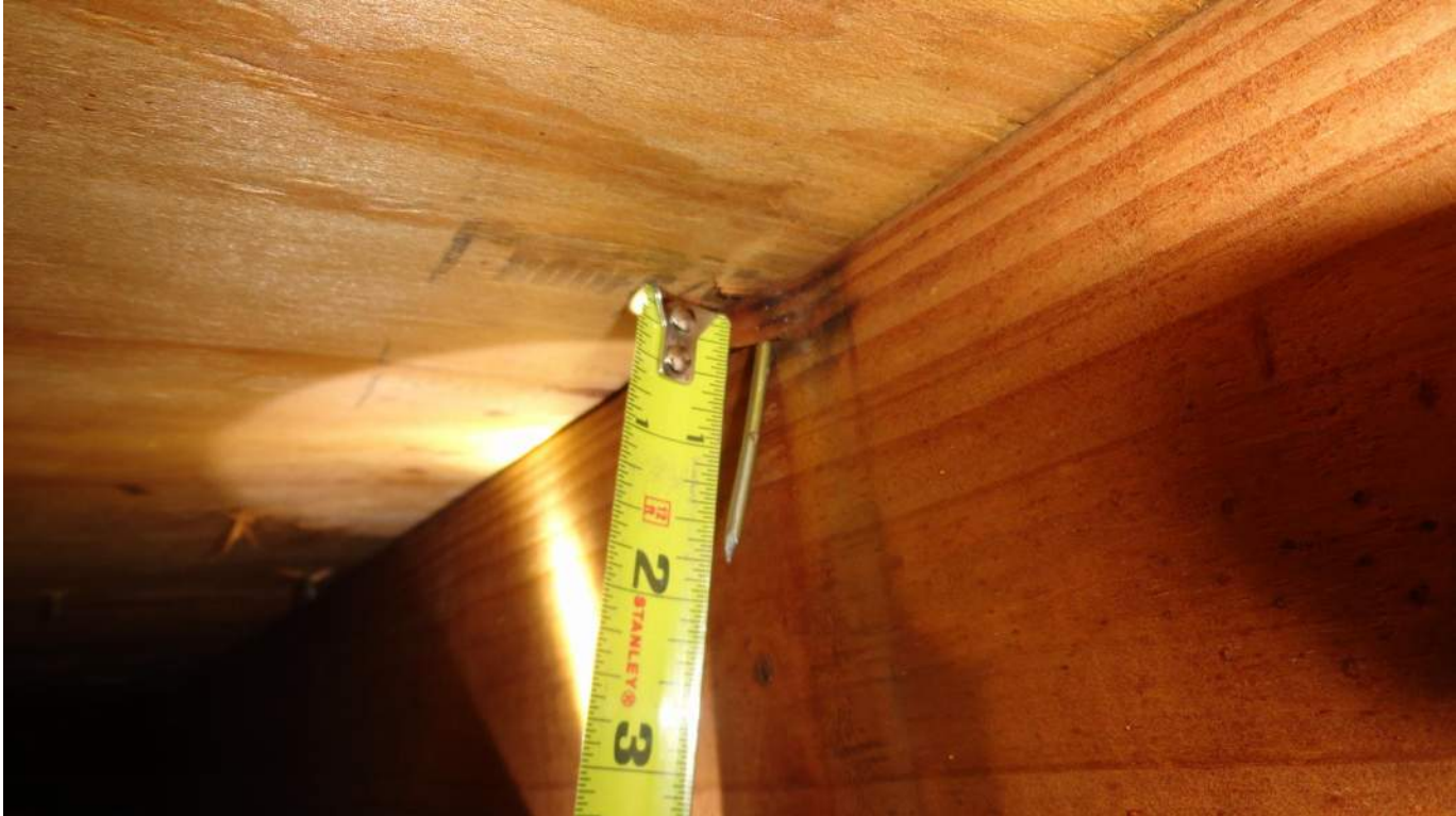
3. Roof Deck Attachment - 8d Ring Shank Nails