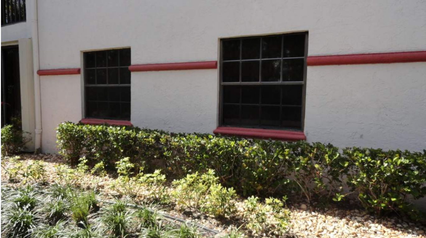
7. Opening Protection - Unprotected Unrated Windows