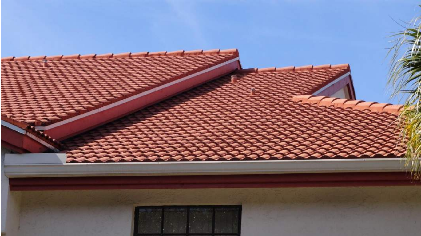
2. Roof Covering - Concrete Tile