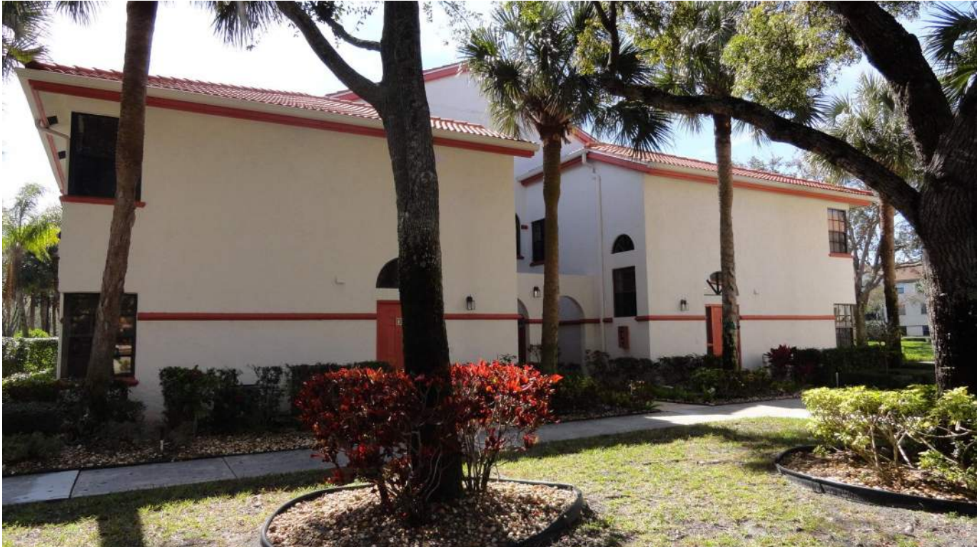
5. Roof Geometry - Right Elevation - Non-Hip