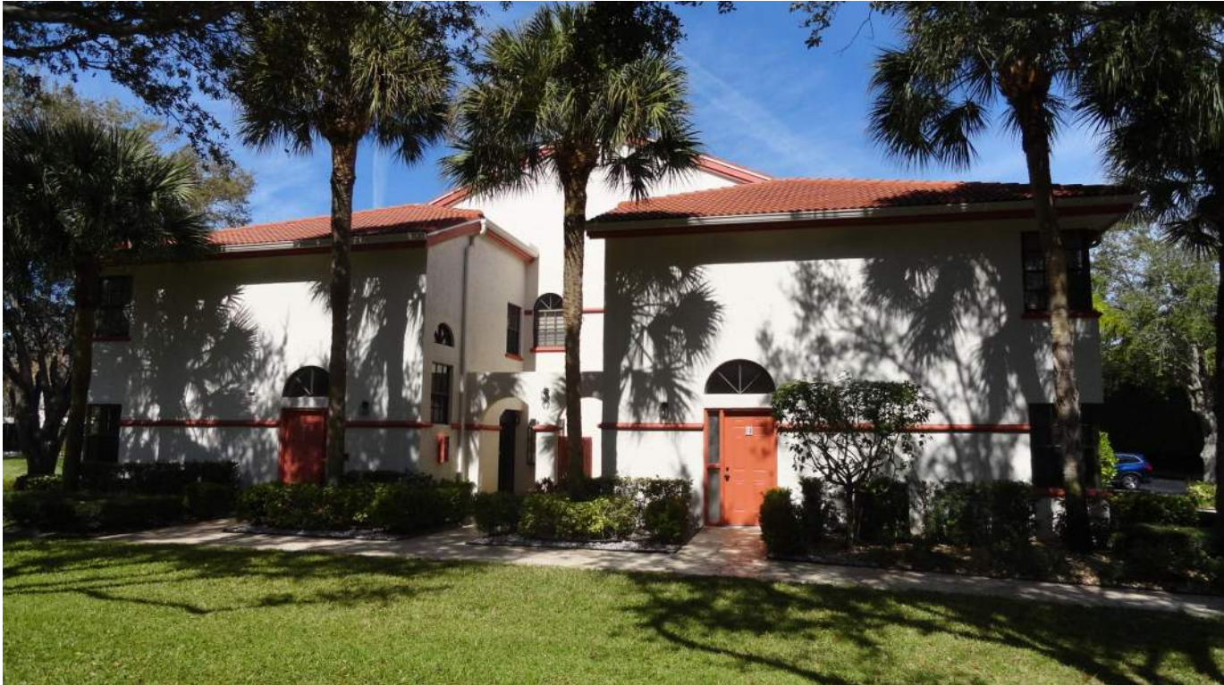
5. Roof Geometry - Left Elevation - Non-Hip