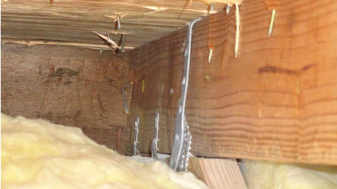
4. Roof to Wall Attachment - Single Wraps - Steel Straps w/ 2 Nails Min. at Face