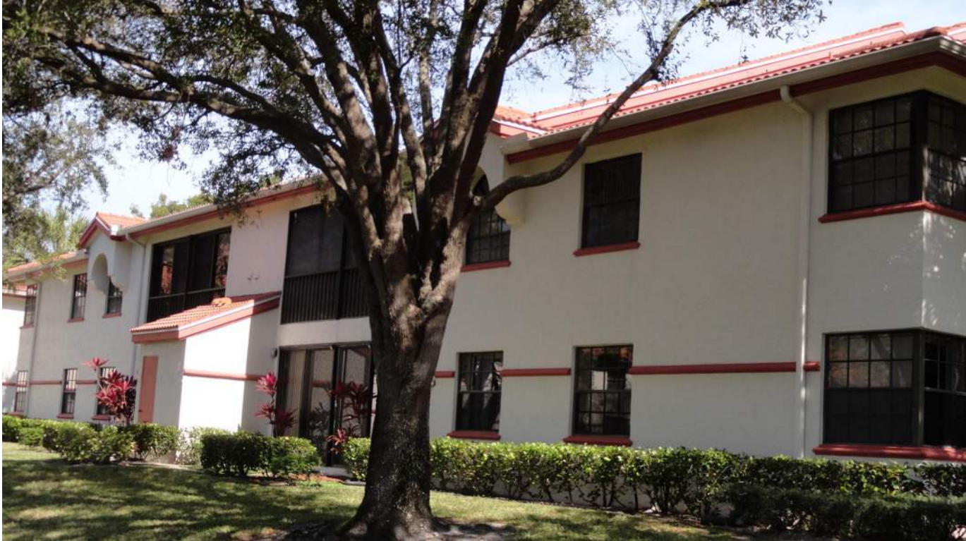
5. Roof Geometry - Rear Elevation - Hip