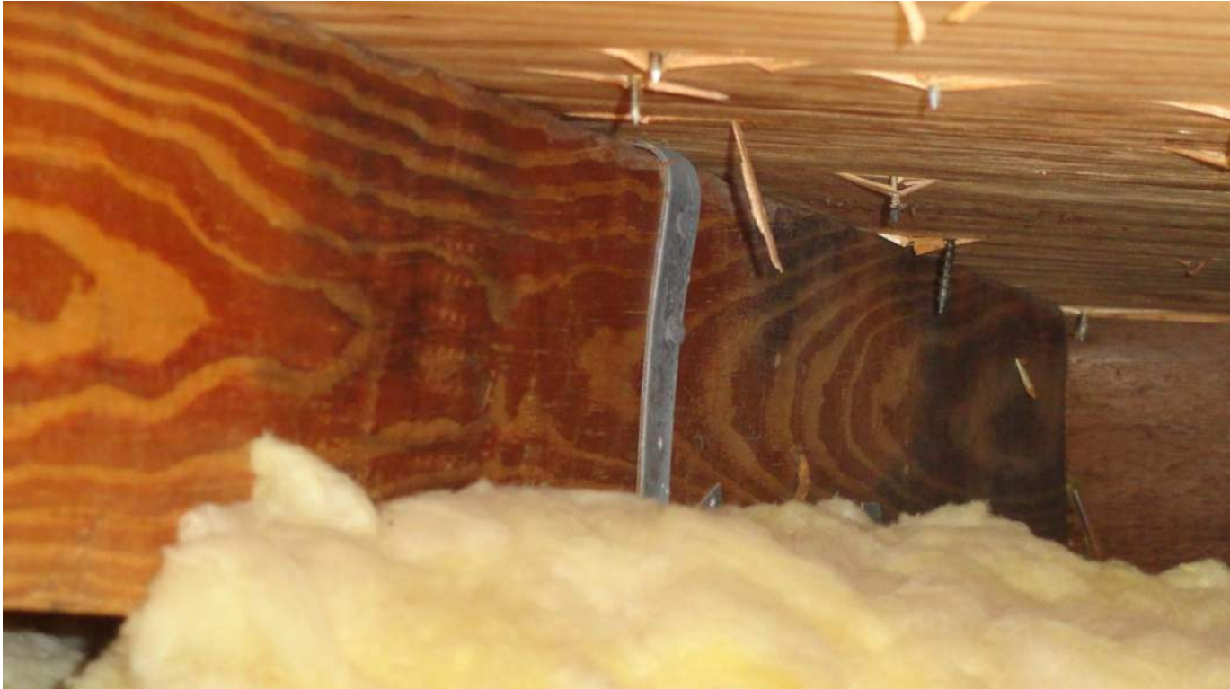
4. Roof to Wall Attachment - Single Wraps - Steel Straps w/ 1 Nail Min. at Back