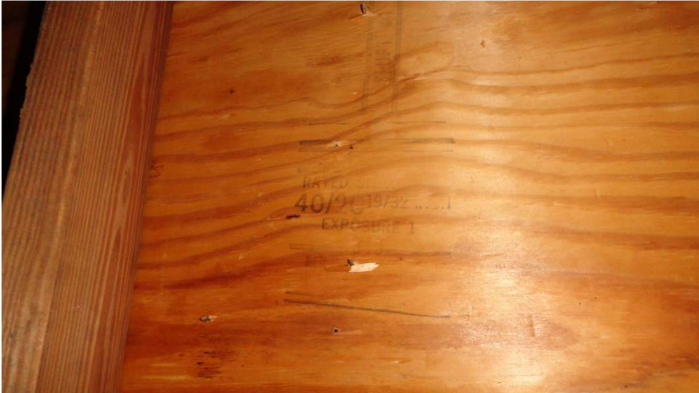
3. Roof Deck Attachment - 19/32" Plywood Deck