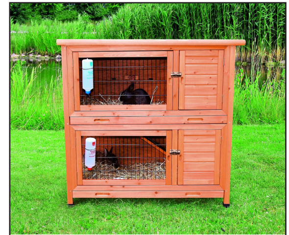
Sturdy wooden hutches are the most reliable form of protection for outdoor small animal enclosures such as rabbits and guinea pigs. Securely attach a side of the cage to a permanent structure to prevent the hutch from falling over. Secure doors with locks, keep top covered and secured. In bear country, add an electric fence for further protection.

For More Resources on Electric Fencing: http://MyFWC.com/Media/1333878/ElectricFence.pdf