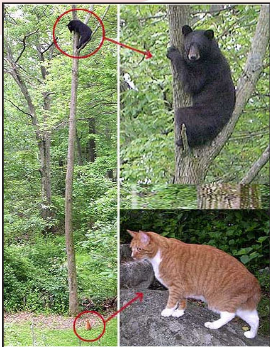
In the event of a pet treeing a bear, call your pet inside to a safe and secure area, allowing the bear time to retreat.