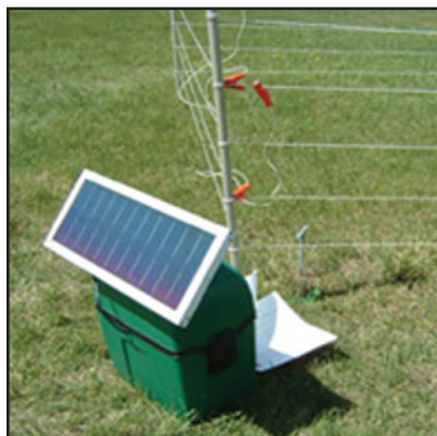
Protect your pets with an electric fencing enclosure. Check often to ensure that the fence is functioning properly.

For More Resources on Electric Fencing: http://MyFWC.com/Media/1333878/ElectricFence.pdf